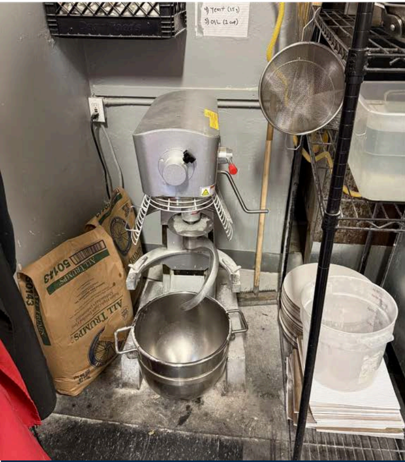
Commercial Dough Mixer