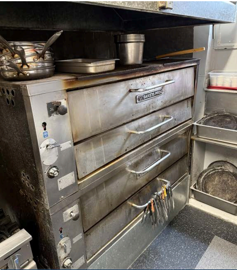
Bakers Pride Deck Oven