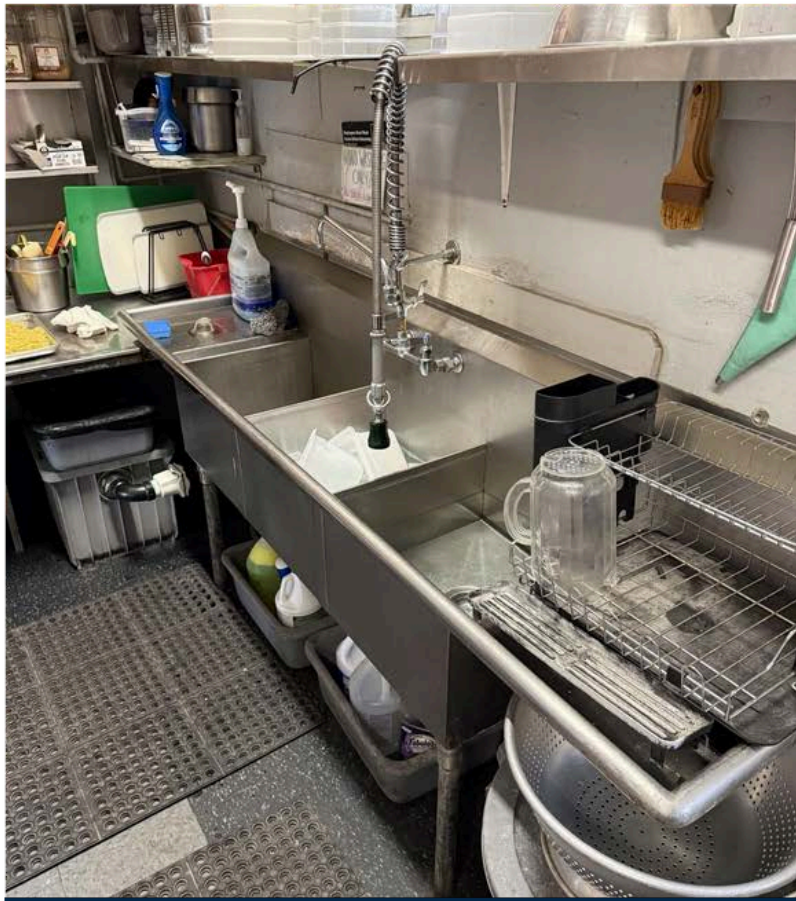
3-Compartment Sink Station