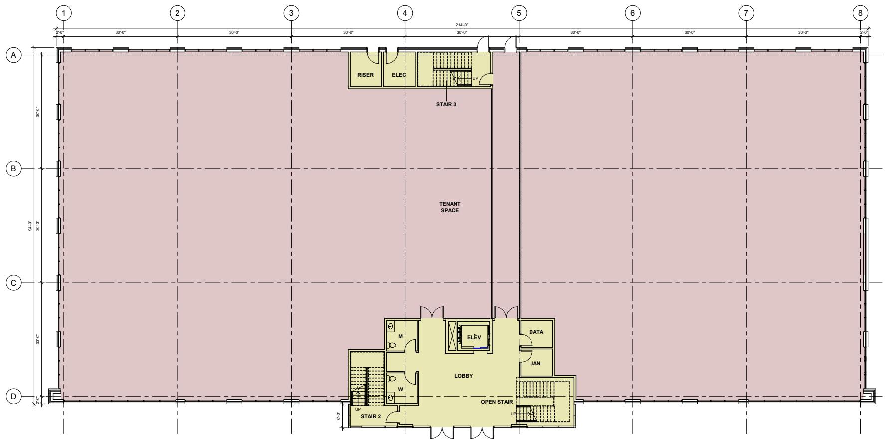
1ST FLOOR CONCEPT PLAN