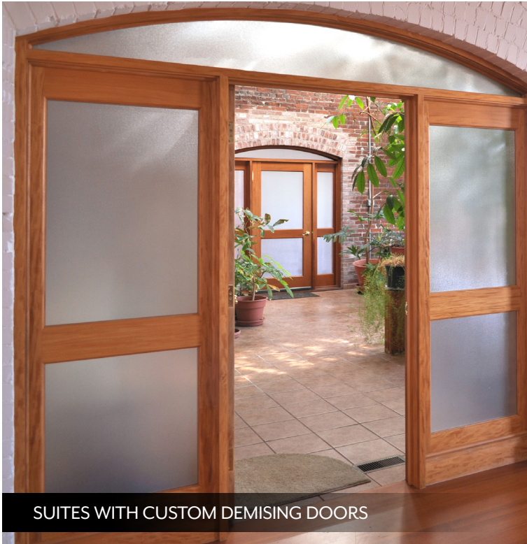
SUITES WITH CUSTOM DEMISING DOORS