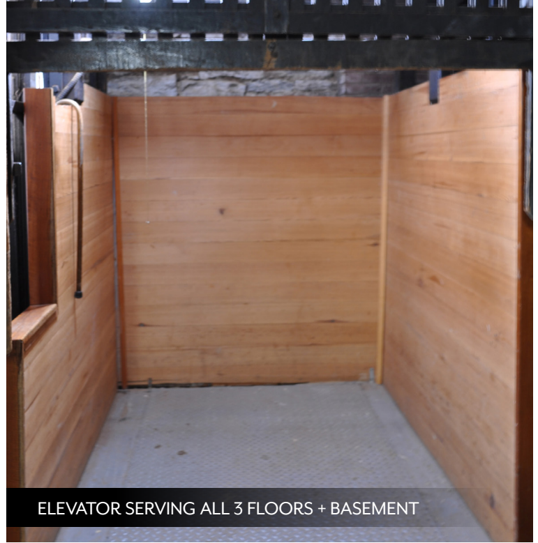
ELEVATOR SERVING ALL 3 FLOORS + BASEMENT