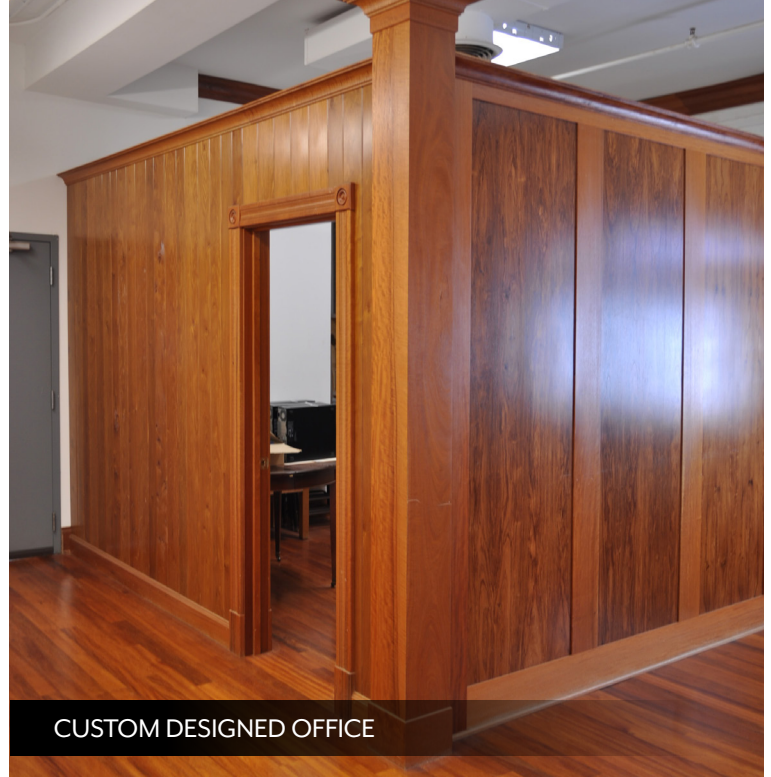
CUSTOM DESIGNED OFFICE