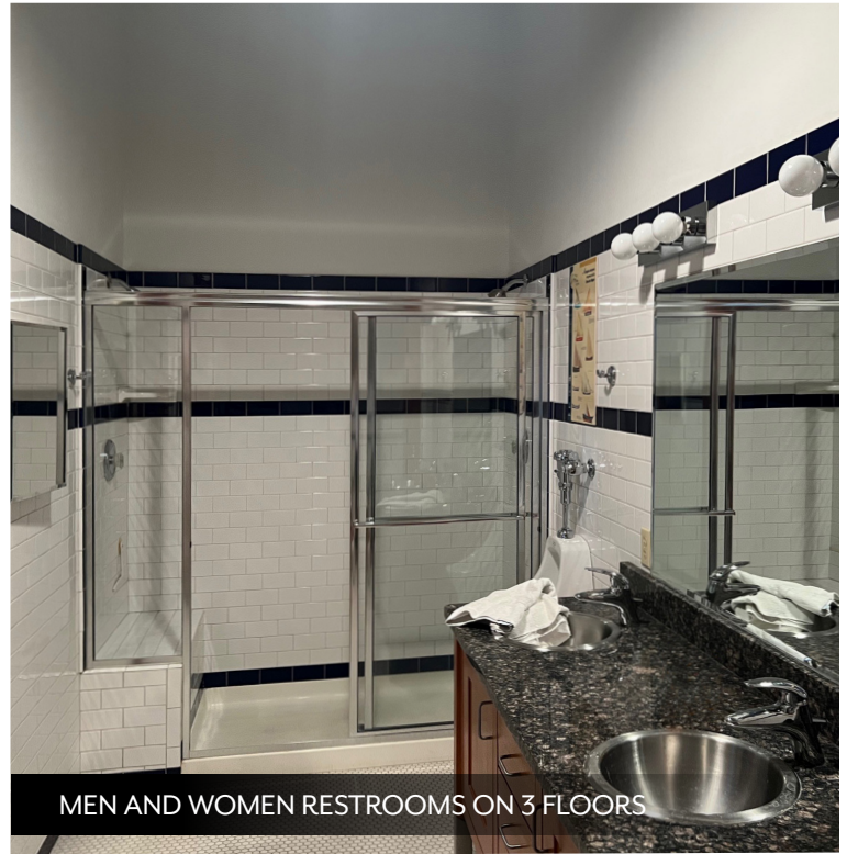
MEN AND WOMEN RESTROOMS ON 3 FLOORS

Information herein has been obtained from the owner of the property or from other sources. The brokers do not guarantee the accuracy of this information. Sellers and brokers make no representation as to the environmental or other conditions of the property and that purchaser investigate fully.