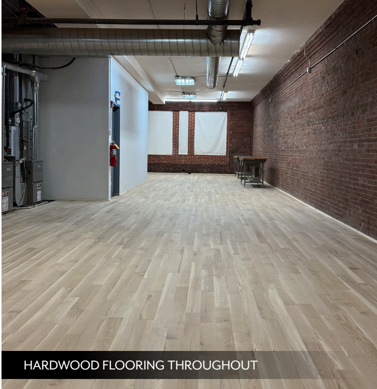
HARDWOOD FLOORING THROUGHOUT