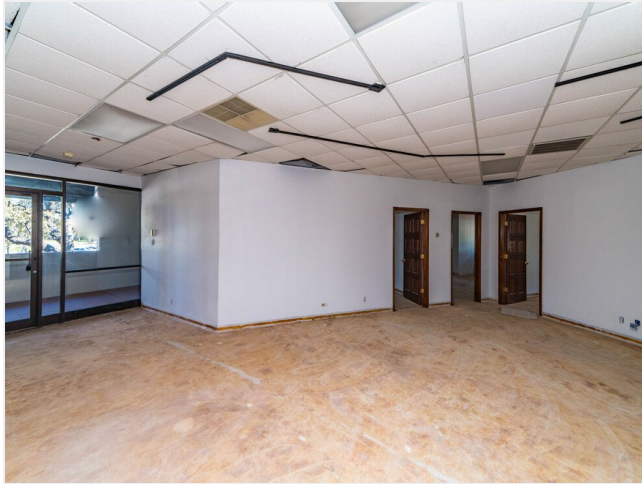
The Elms Site Plan- 111024_1

11800-11874 Wurzbach Rd, San Antonio, TX 78230