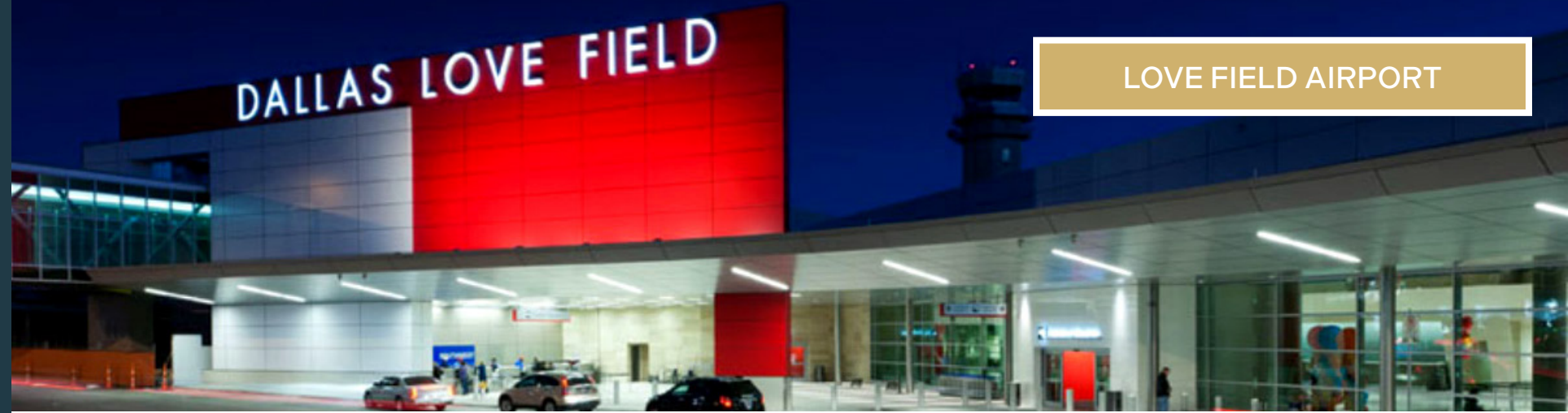
LOVE FIELD AIRPORT