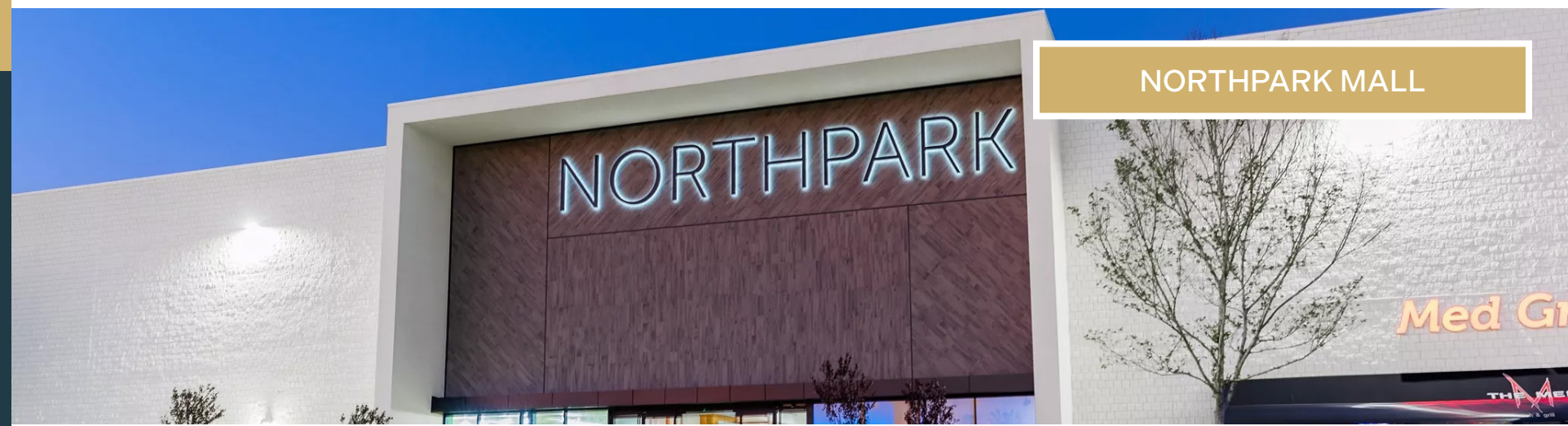
NORTH PARK MALL