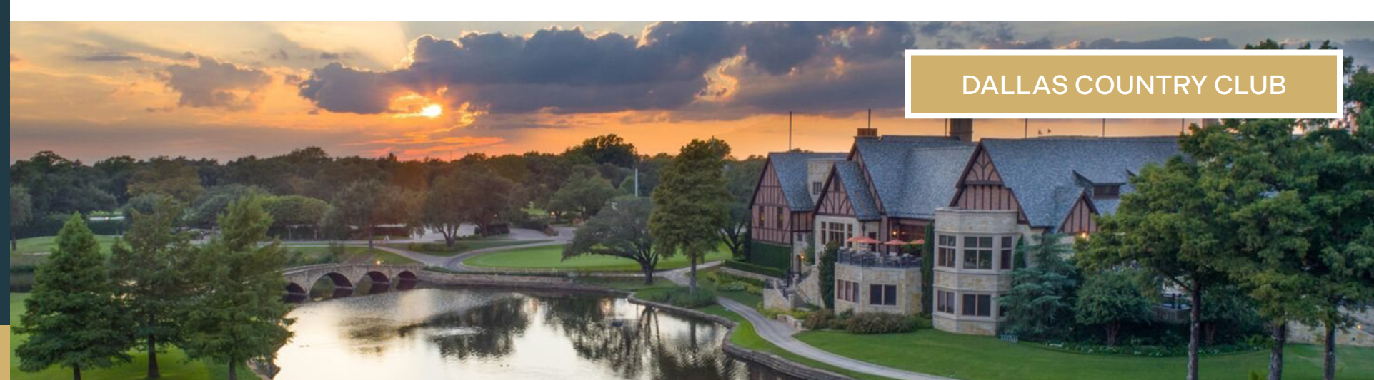
DALLAS COUNTRY CLUB