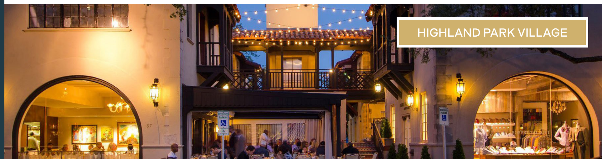
HIGHLAND PARK VILLAGE