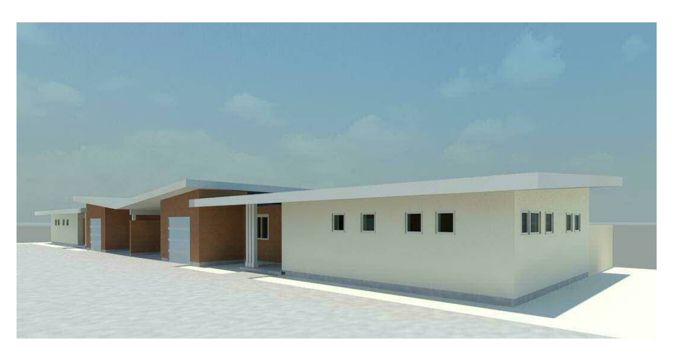
Unit 2 from Southeast

Entry from Palo Alto Avenue (all renderings on summer solstice at noon)