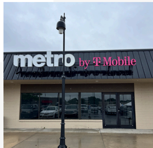
Suite 110 - 2,108 SF