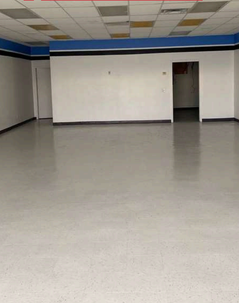
Suite 30 - 1,625 SF