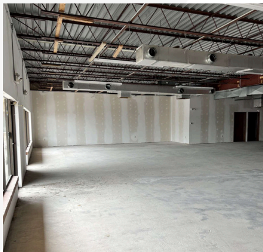
Suite 100 - 4,221 SF