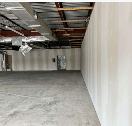
Suite 100 - 4,221 SF