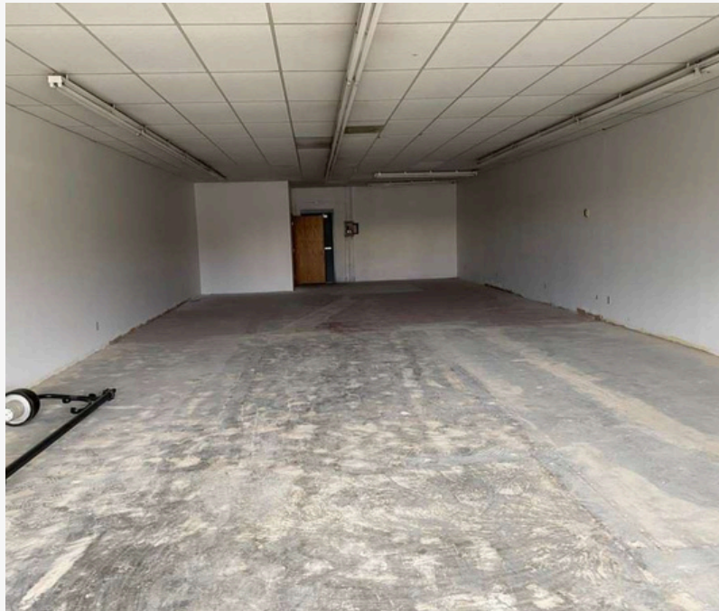
Suite 50 - 1,625 SF