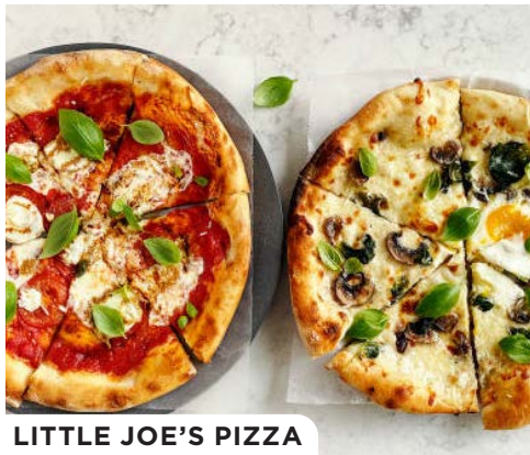
LITTLE JOE'S PIZZA