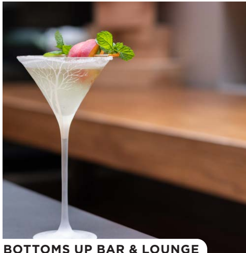
BOTTOMS UP BAR & LOUNGE