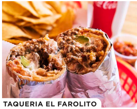
TAGUERIA EL FAROLITO