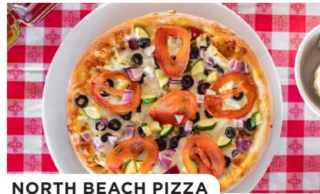
NORTH BEACH PIZZA