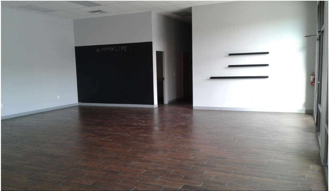
Front Door Entry