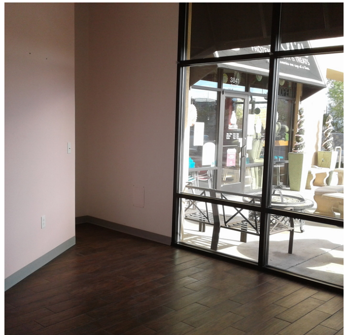
Office with Window