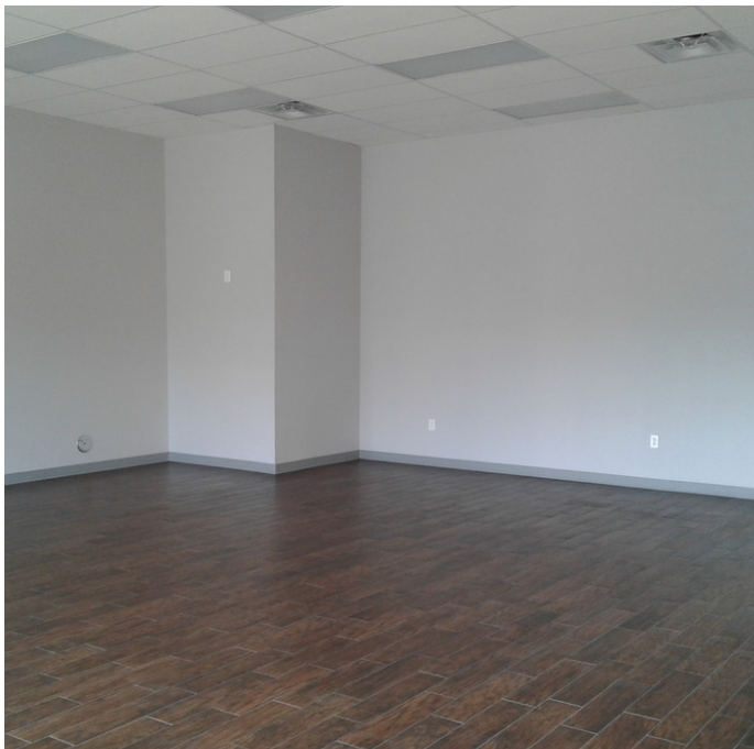
Front Door Entry