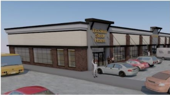
3 Left Side