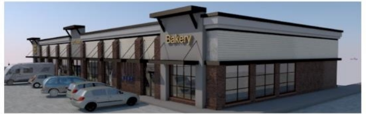
2 Right Side