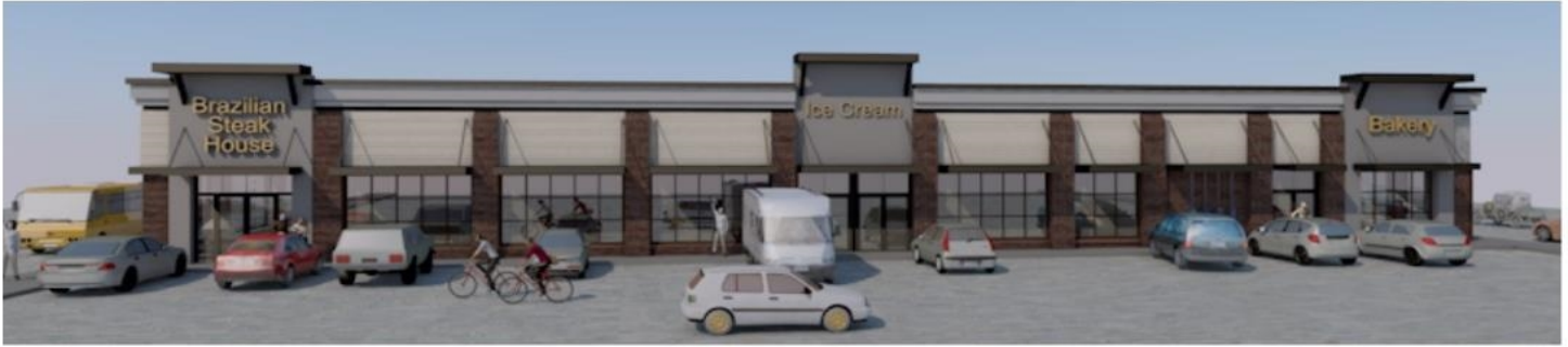
1 Front View