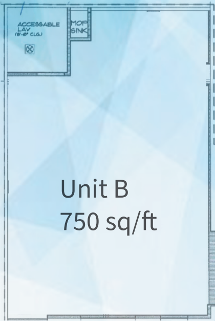
Unit B 750 sq/ft