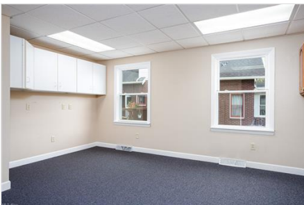
Unfurnished room with a drop ceiling and carpet