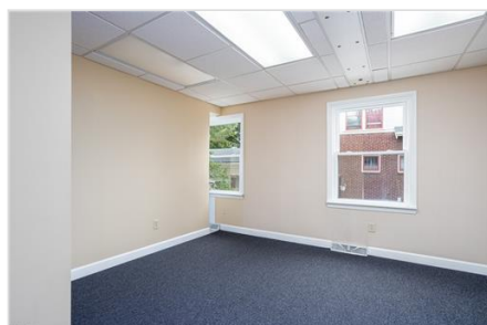
Carpeted spare room with a paneled ceiling