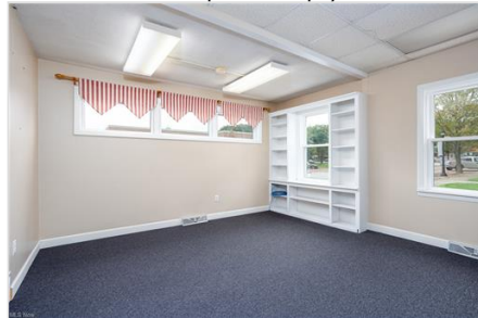
Unfurnished room featuring plenty of natural light and carpet flooring