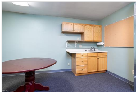
Kitchen featuring light brown cabinetry, sink, and dark colored carpet