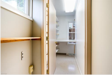
View of walk in closet

Information is Believed To Be Accurate But Not Guaranteed