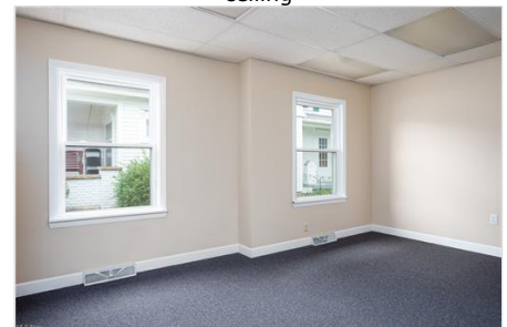
Carpeted spare room with a paneled ceiling