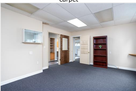
Empty room with a drop ceiling and carpet