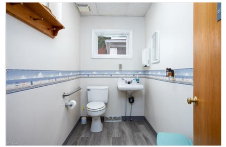
Bathroom featuring a drop ceiling, toilet, and hardwood / wood-style flooring