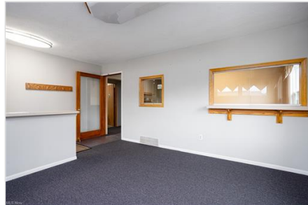
View of carpeted empty room