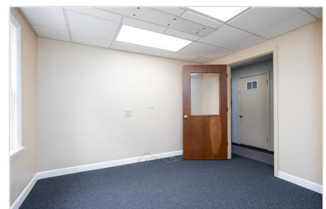
Empty room featuring a paneled ceiling and dark colored carpet