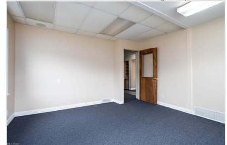
Carpeted empty room featuring a paneled ceiling