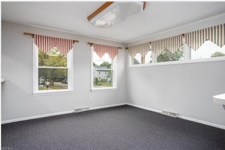
View of carpeted empty room