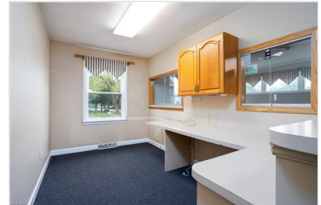
Unfurnished office featuring carpet