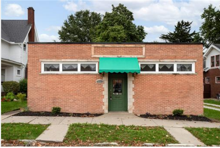
View of front of house

Office SqFt: 0 Bsmt: Yes Yr: 1956 Acres: 0.05 $1,250