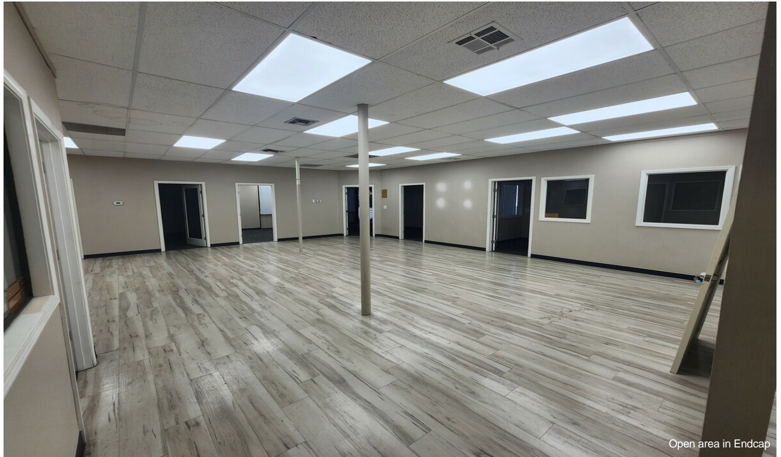
Open area in Endcap