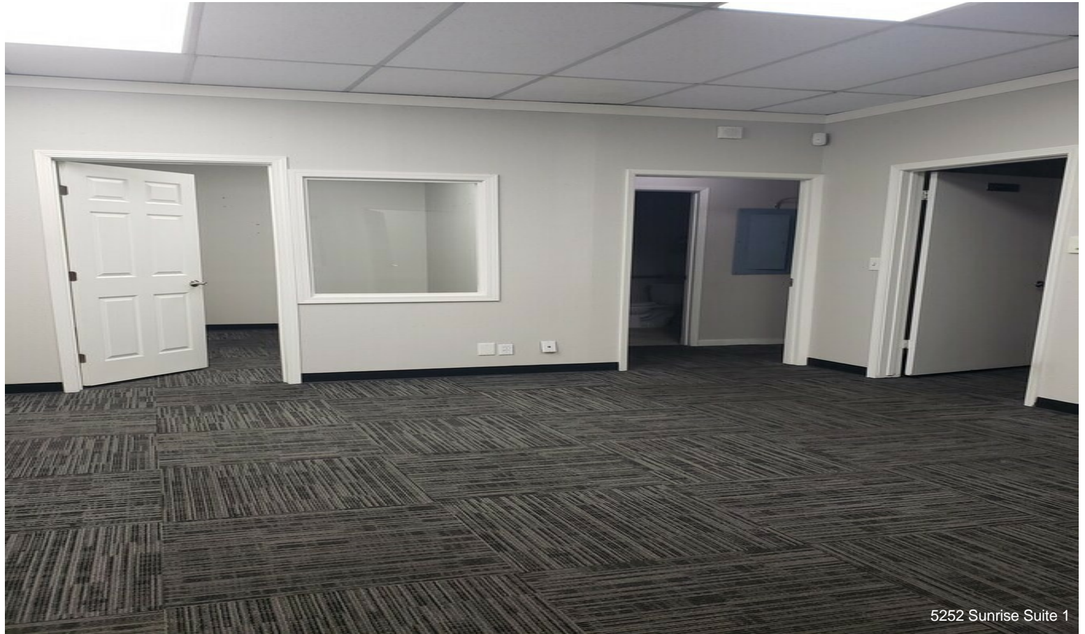
5252 Sunrise Suite 1