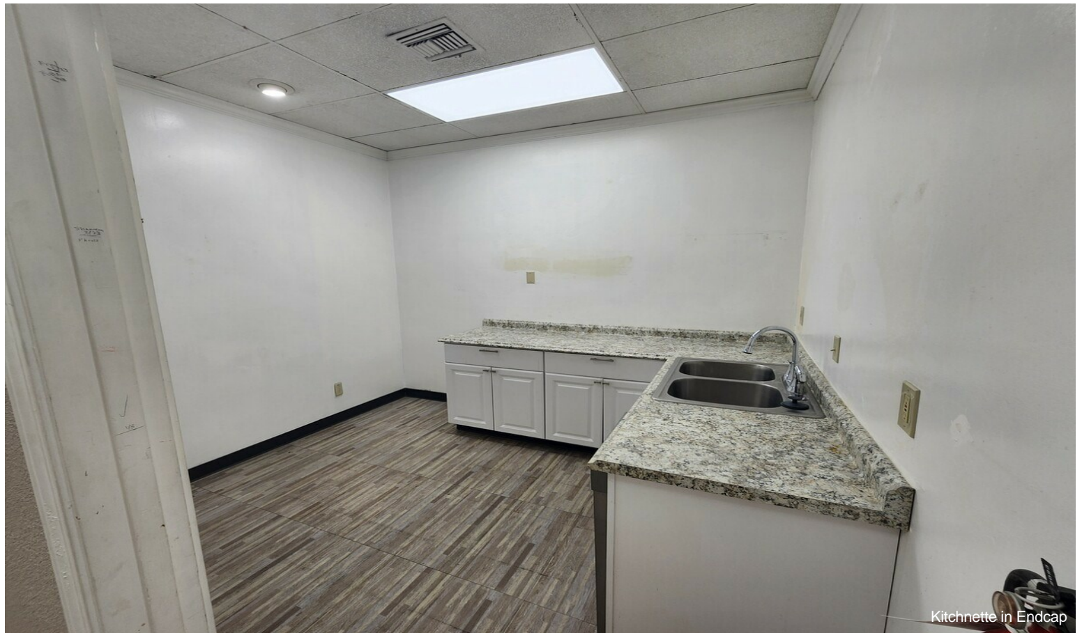
Kitchenette in Endcap