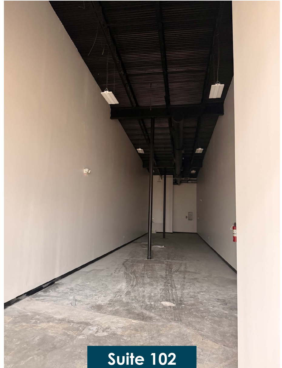
Suite 102 1,260 SF