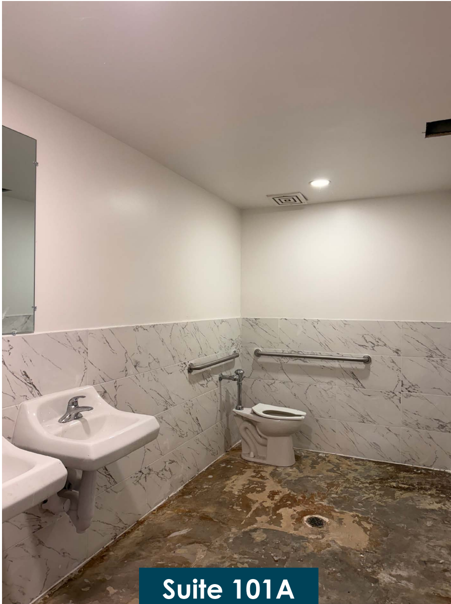
Suite 101A 2,035 SF