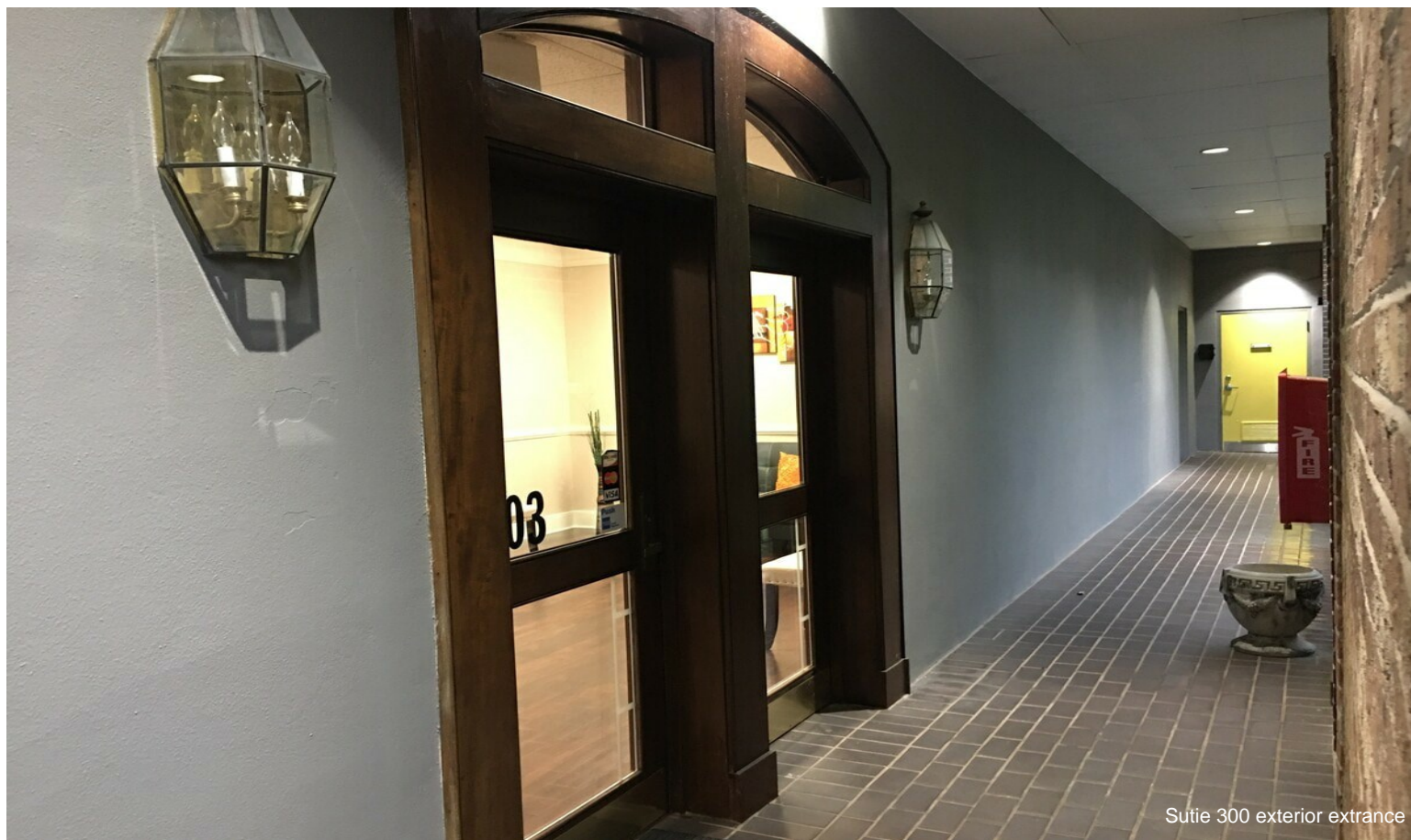
Sutie 300 exterior entrance