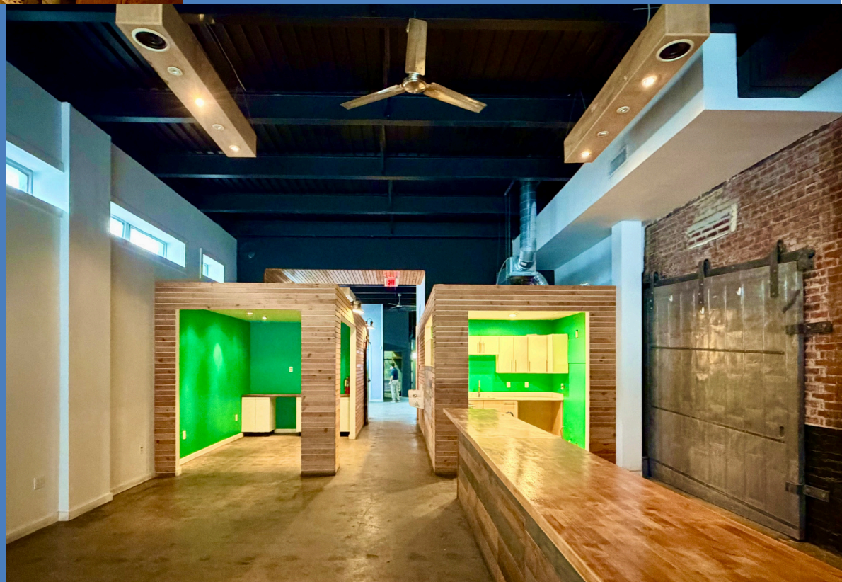
Polished Concrete Floors