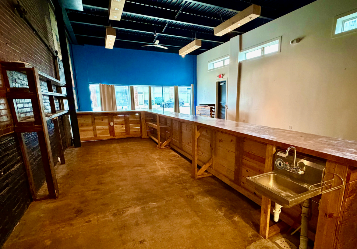
High Exposed Ceilings