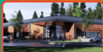
100 Arrowhead ±60,300 SF Flex/Lab/R&D