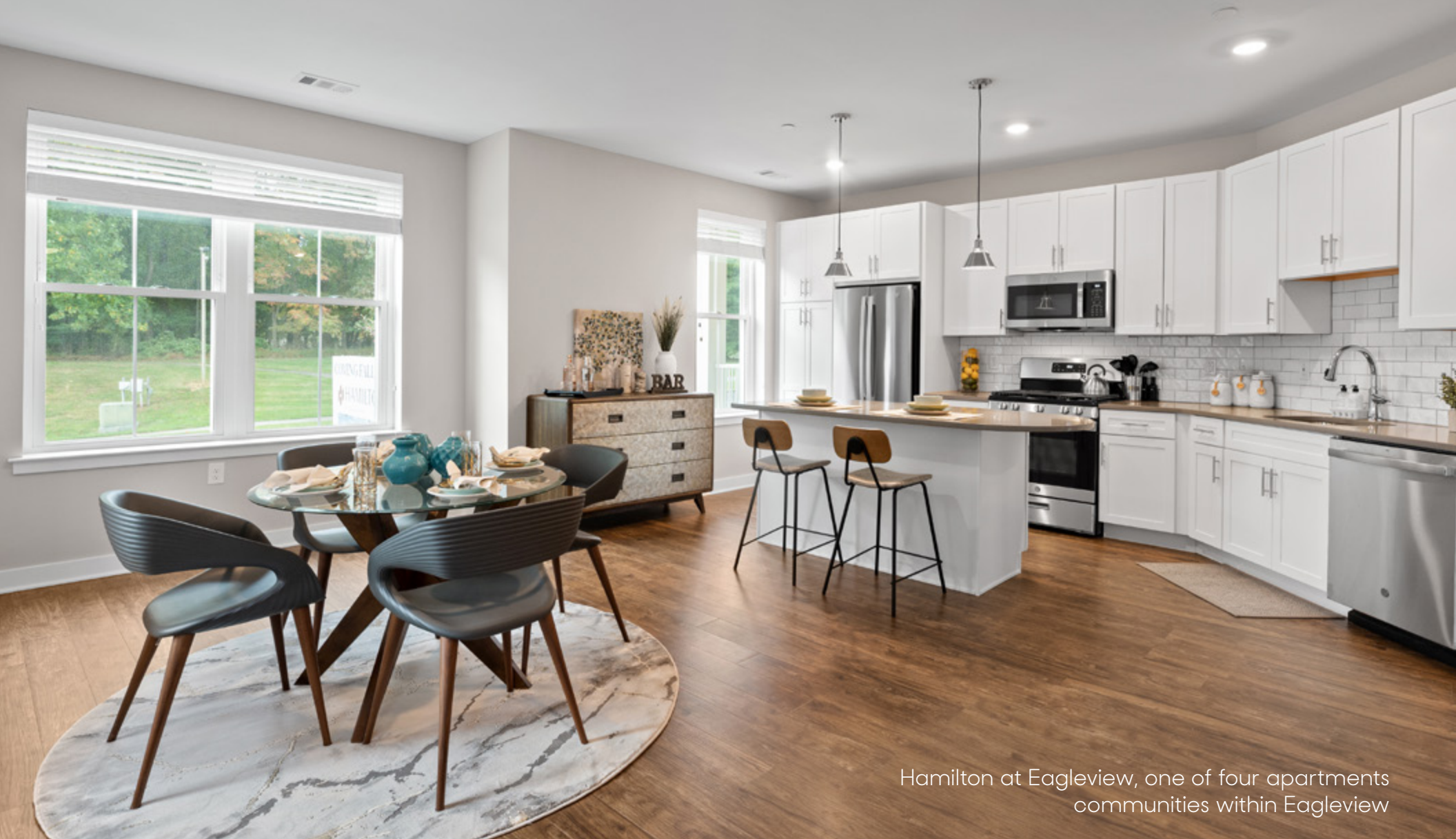
Hamilton at Eagleview, one of four apartments communities within Eagleview

From the Hankin owned, developed, and managed apartment communities within Eagleview, to the single family homes throughout the region, there's no shortage of options for every price point.