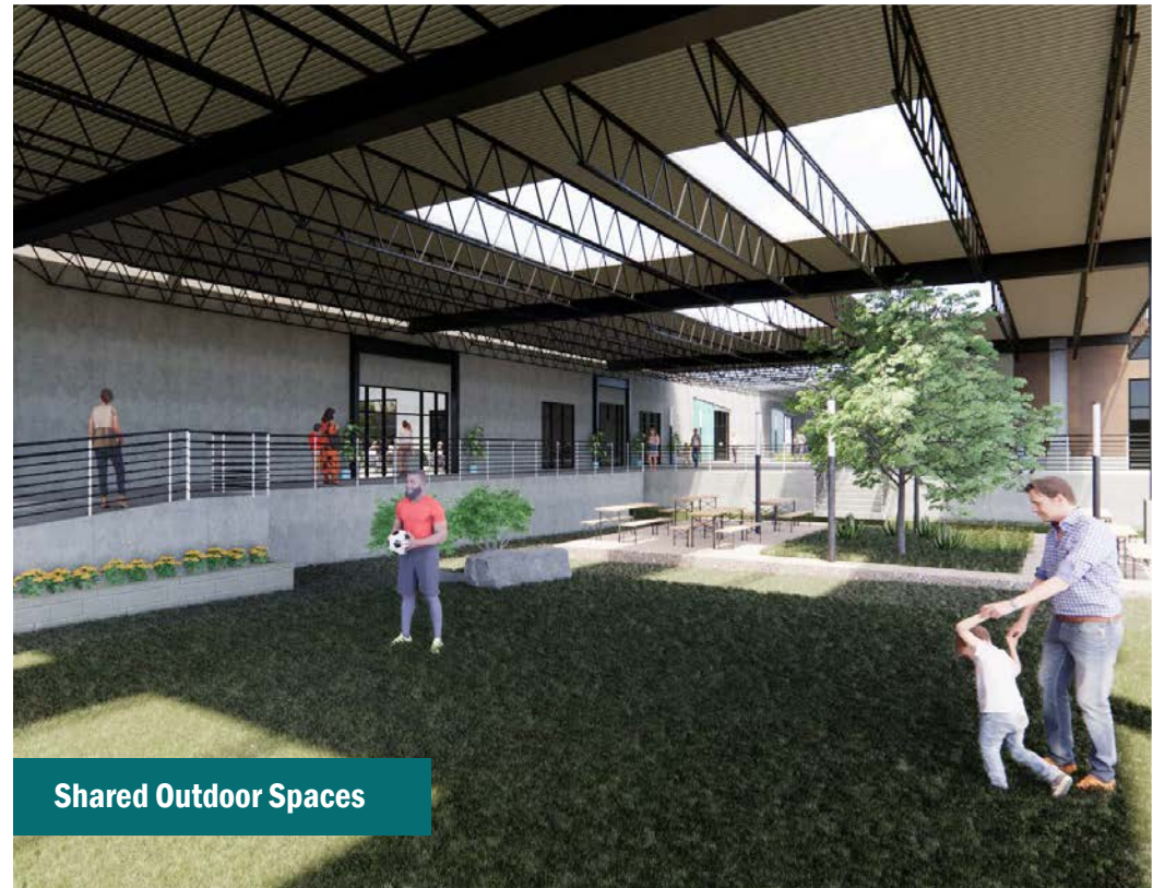
Shared Outdoor Spaces