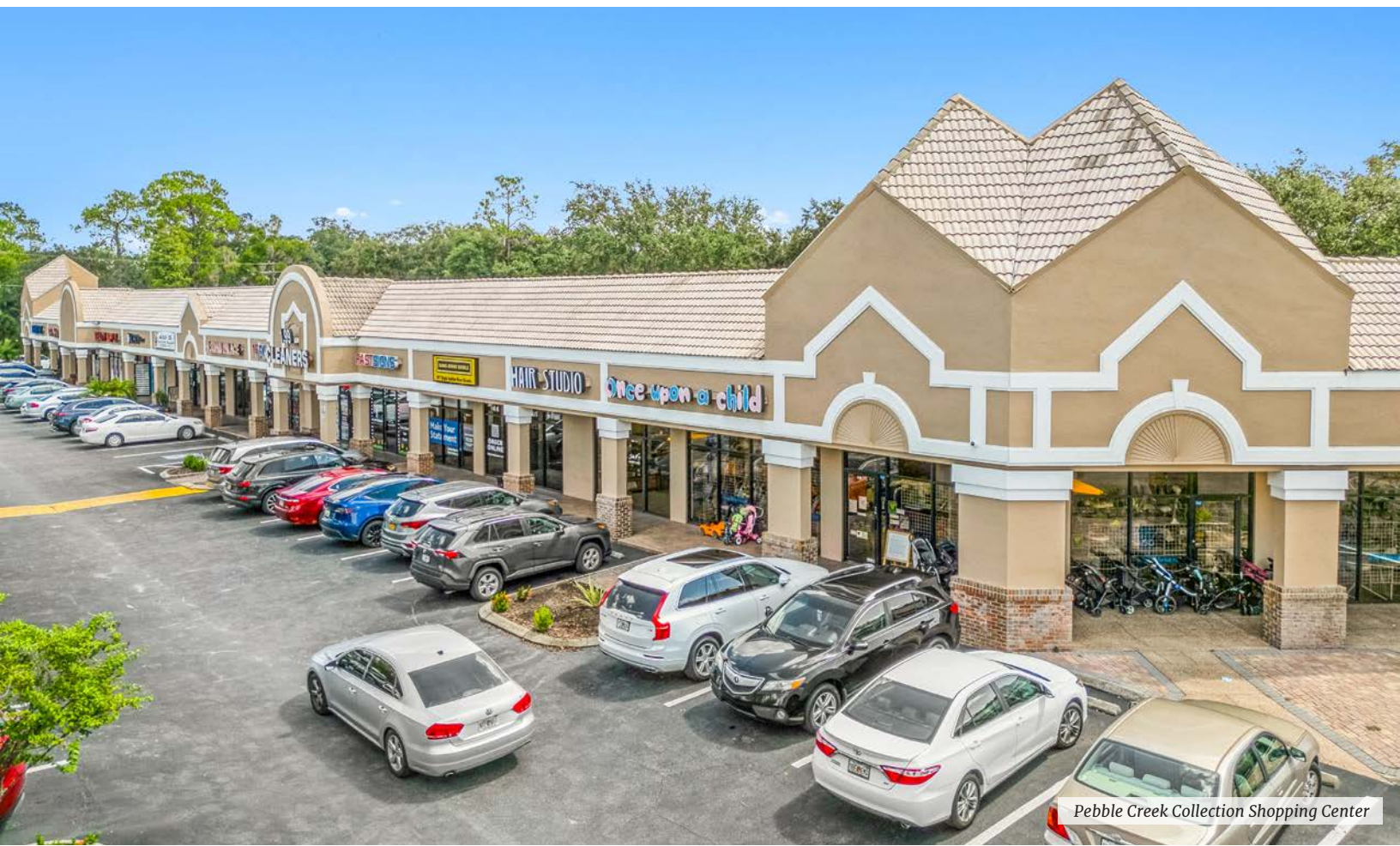
Pebble Creek Collection Shopping Center