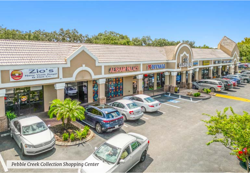
Pebble Creek Collection Shopping Center

19651 BRUCE B DOWNS BLVD • TAMPA, FL • 33647