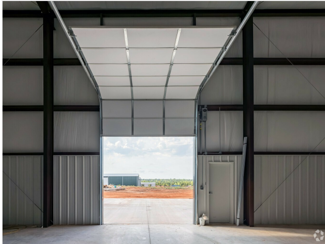
14' overhead door opened.