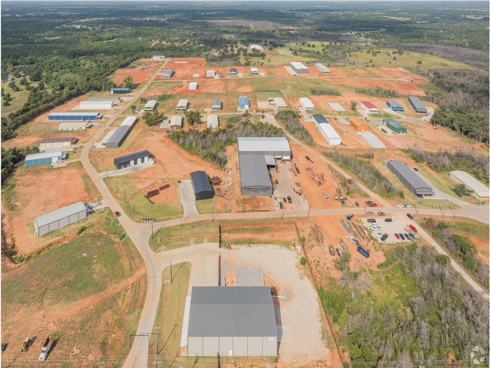
Aerial view of the whole Koloa Industrial Park.