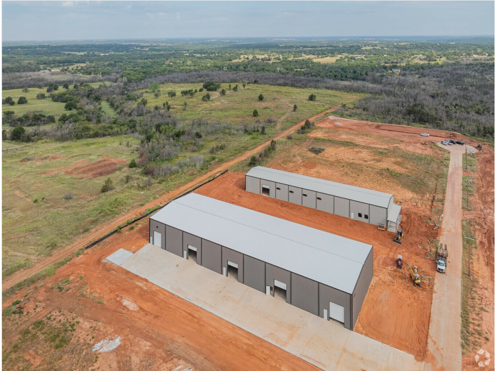
Aerial Context of the building at an angle.