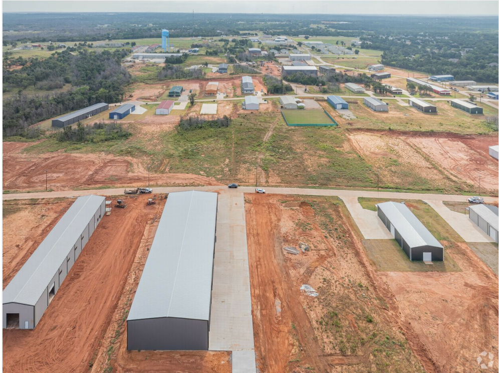
Aerial Context of the building.