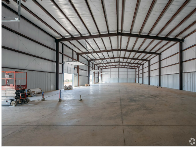
The space offer a clear height ranging from 18' to 38'.