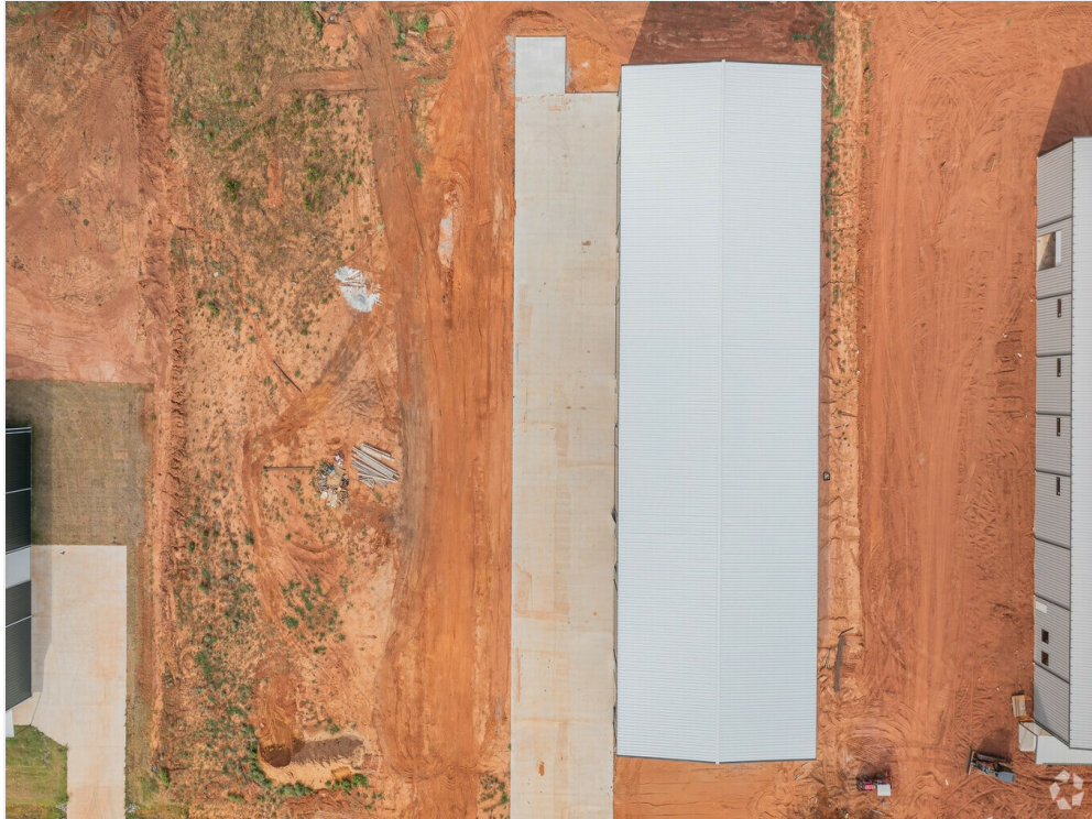
Aerial top down of the building.