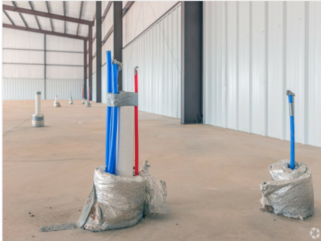
Plumbing pipes are available.