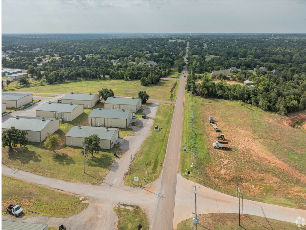
Sooner Road is located right in front of the entrance to Koloa Industrial Park.