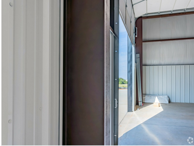
Strong steel crane.