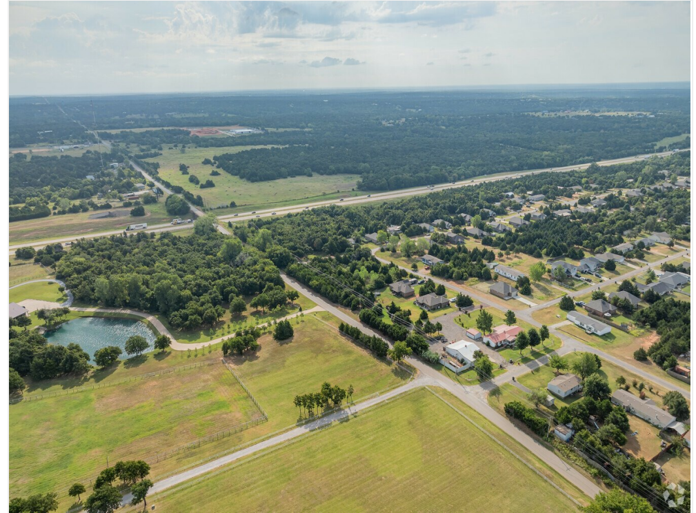
Koloa Industrial Park is conveniently located just 5 minutes from I-35.