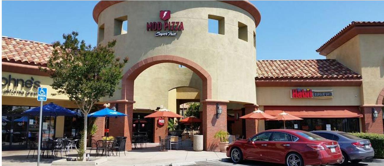
01 – Former MOD Pizza