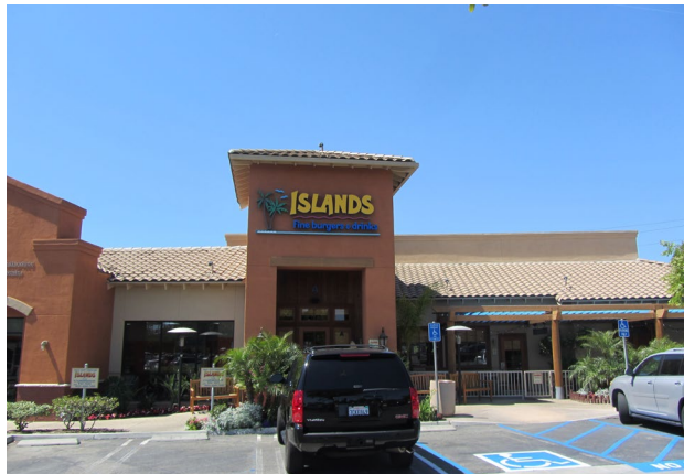
03 – 5,950 SF Islands Restaurant