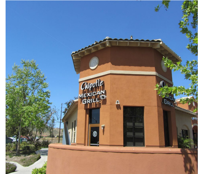
02 – Chipotle Sign Facing 101 Freeway