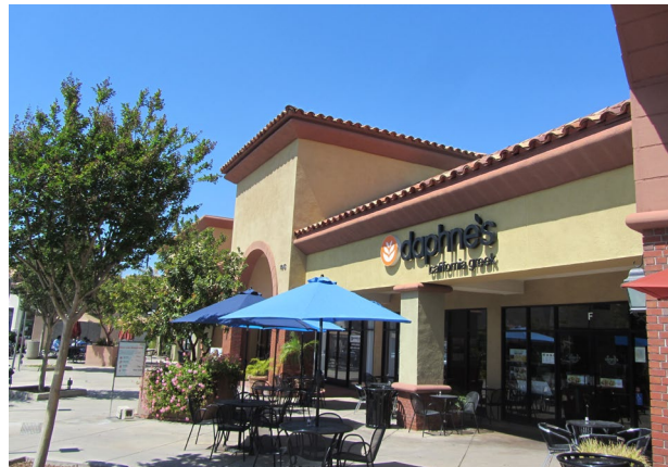
04 – 1,800 SF Daphne's Greek Café & Outdoor Seating