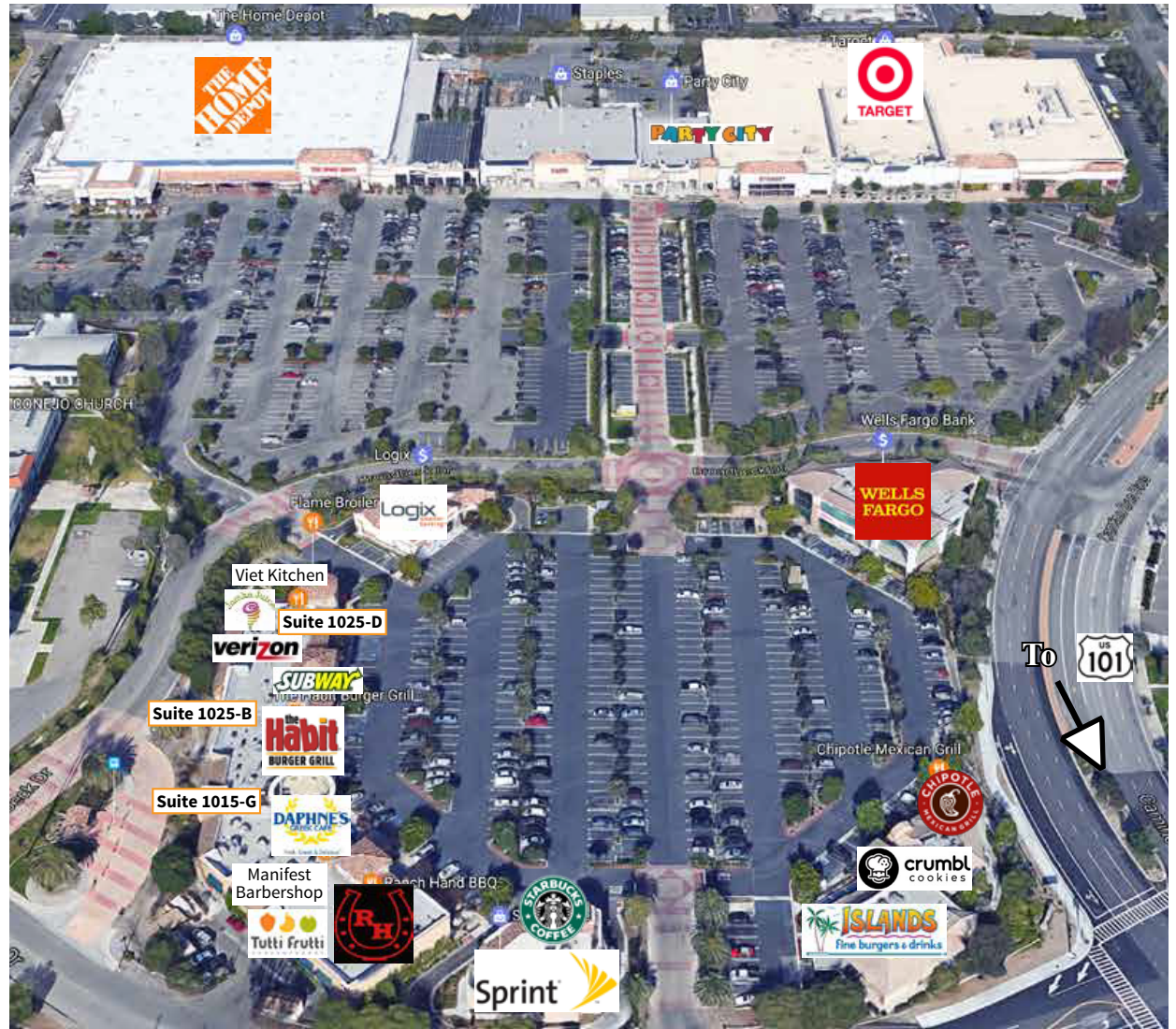
06 – Aerial view of Newbury Village.

Median Visitor Household Income $124,600