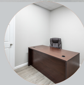
Well-organized office layout