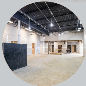
Expansive interior workspace