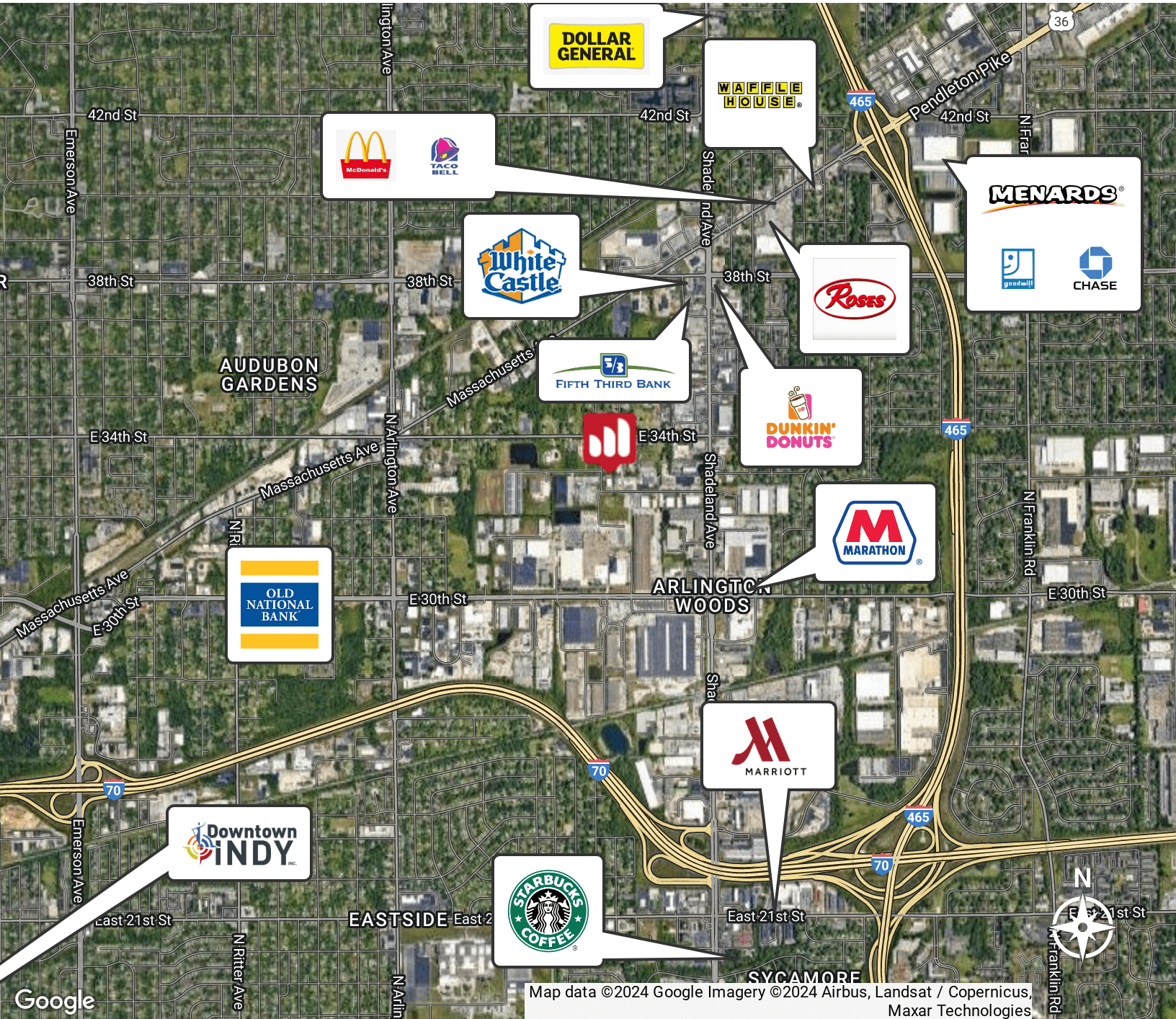
Map data ©2024 Google Imagery ©2024 Airbus, Landsat / Copernicus, Maxar Technologies