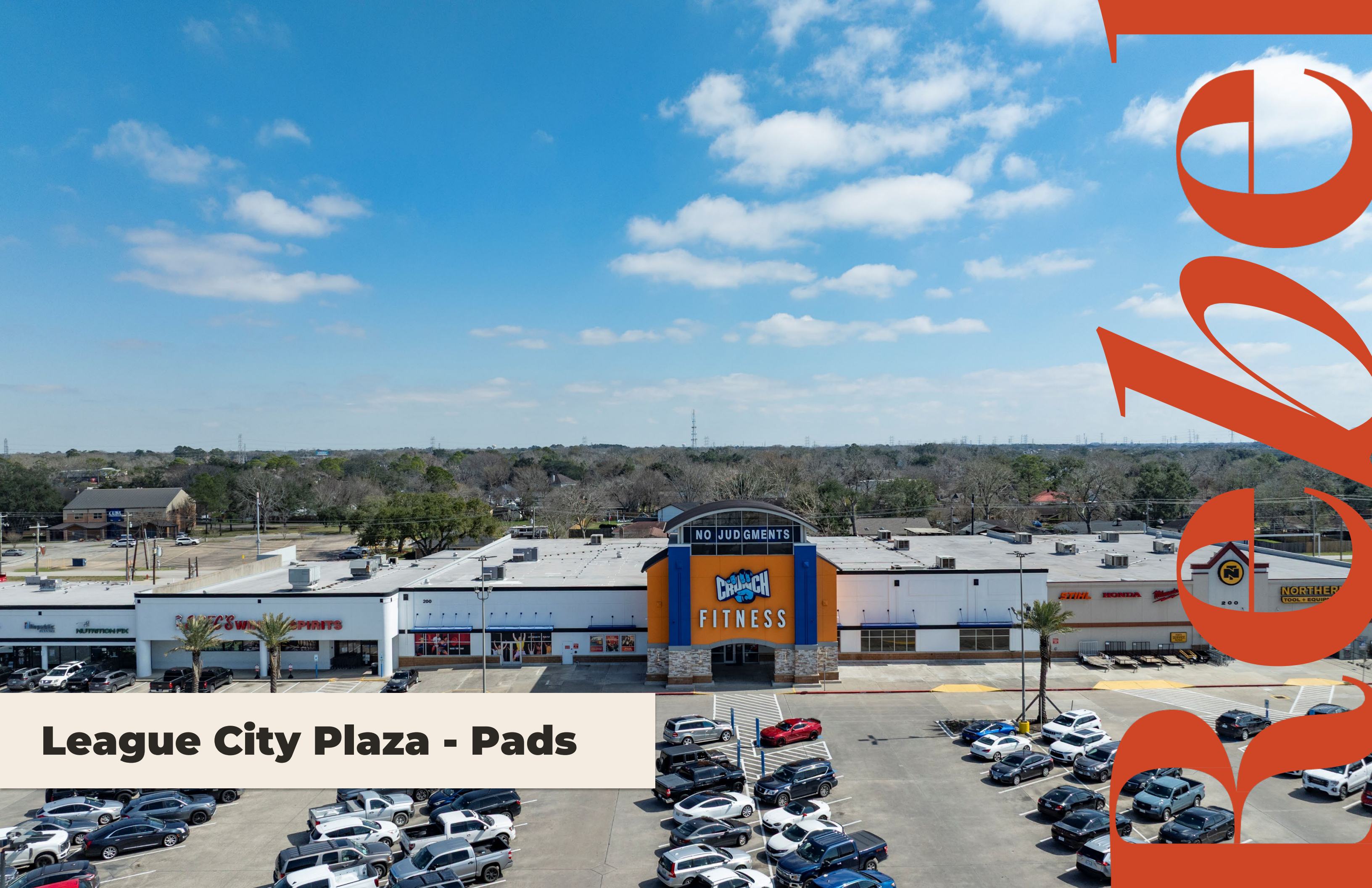
League City Plaza - Pads