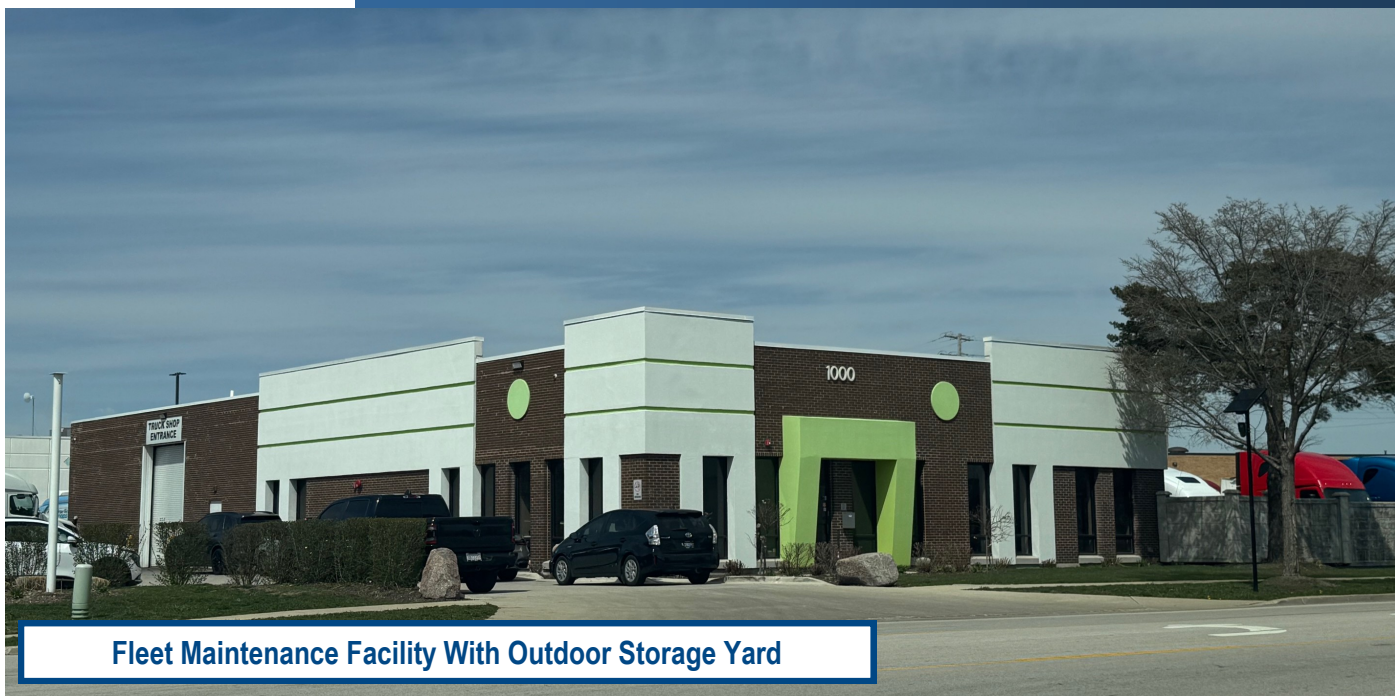
Fleet Maintenance Facility With Outdoor Storage Yard