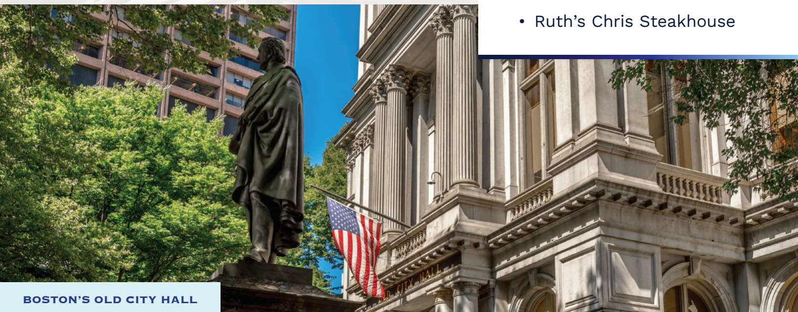
BOSTON'S OLD CITY HALL