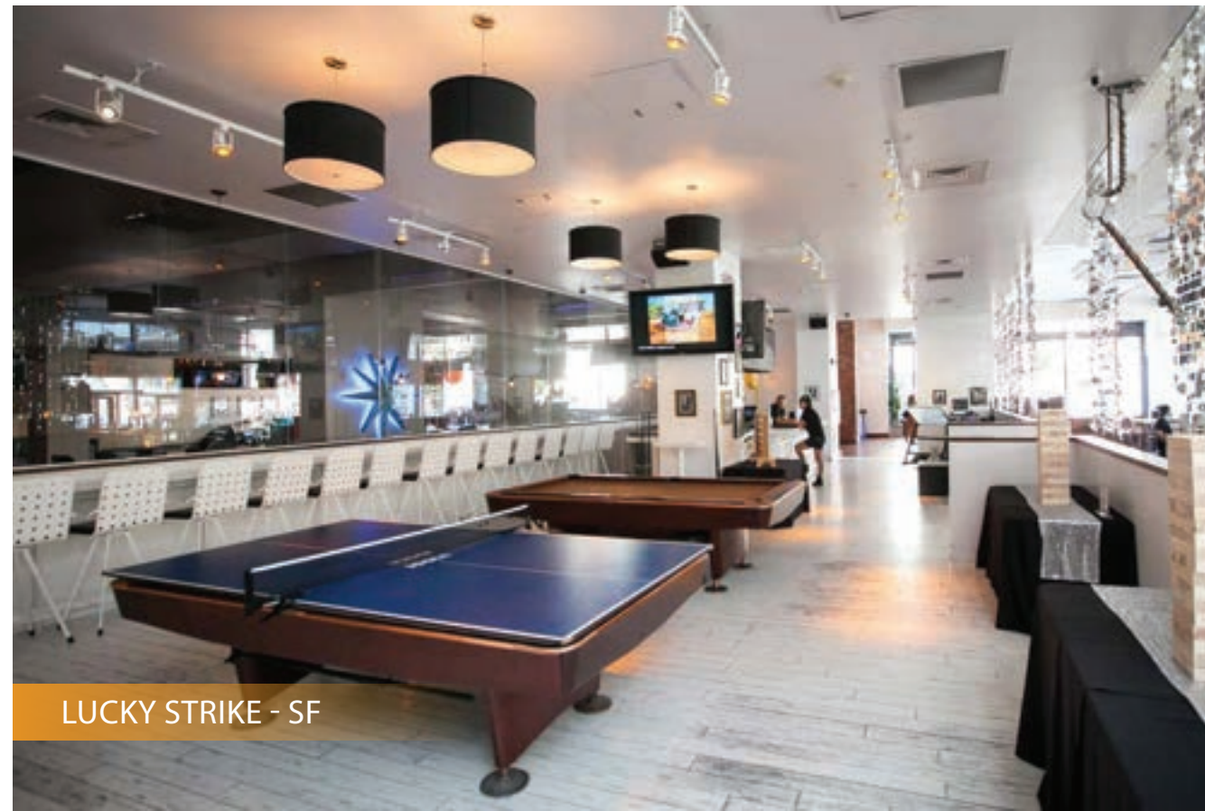
LUCKY STRIKE - SF