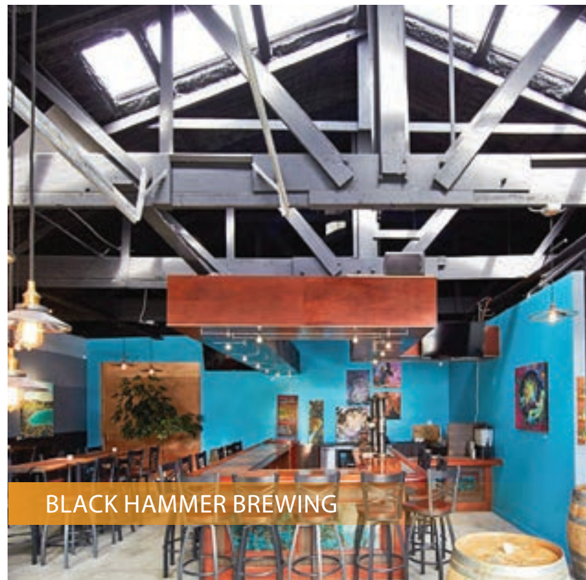
BLACK HAMMER BREWING