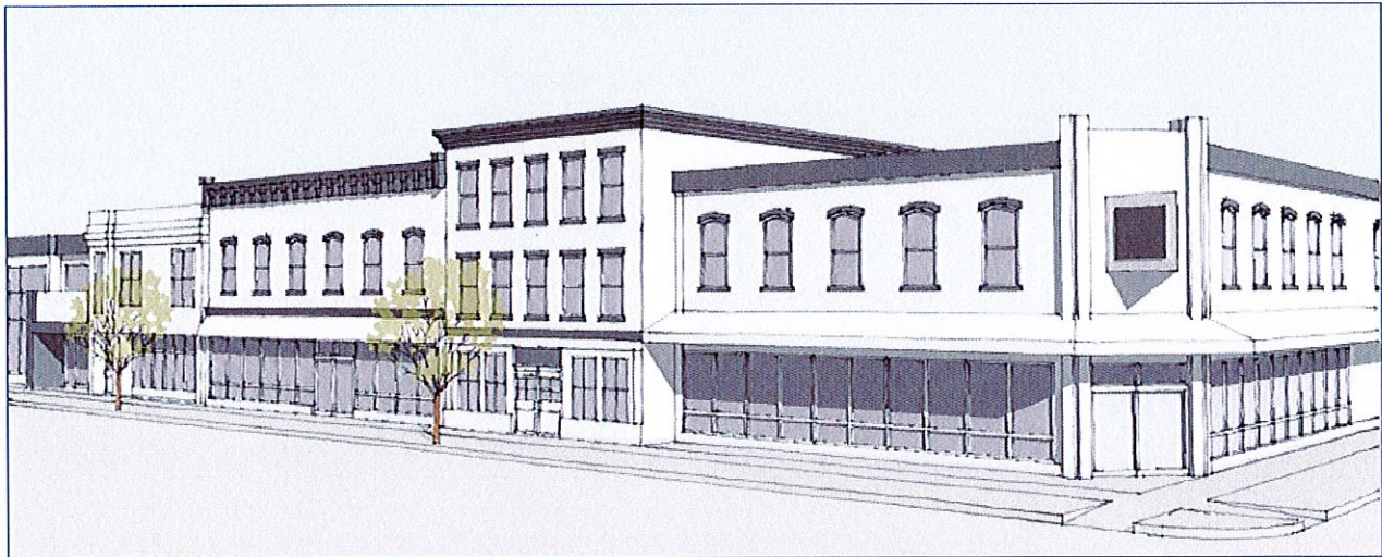
Figure 27: Illustrative Scale and Character

The Mixed-Use Downtown Courthouse Square (MD-CS) character area is intended to maintain the historic character of downtown by providing a diverse mix of traditional commercial retail uses at the street level to capitalize on, maintain and enhance the pedestrian activity, and to visually define the sidewalk edges with interesting buildings that respect the established context of traditional commercial storefront buildings.