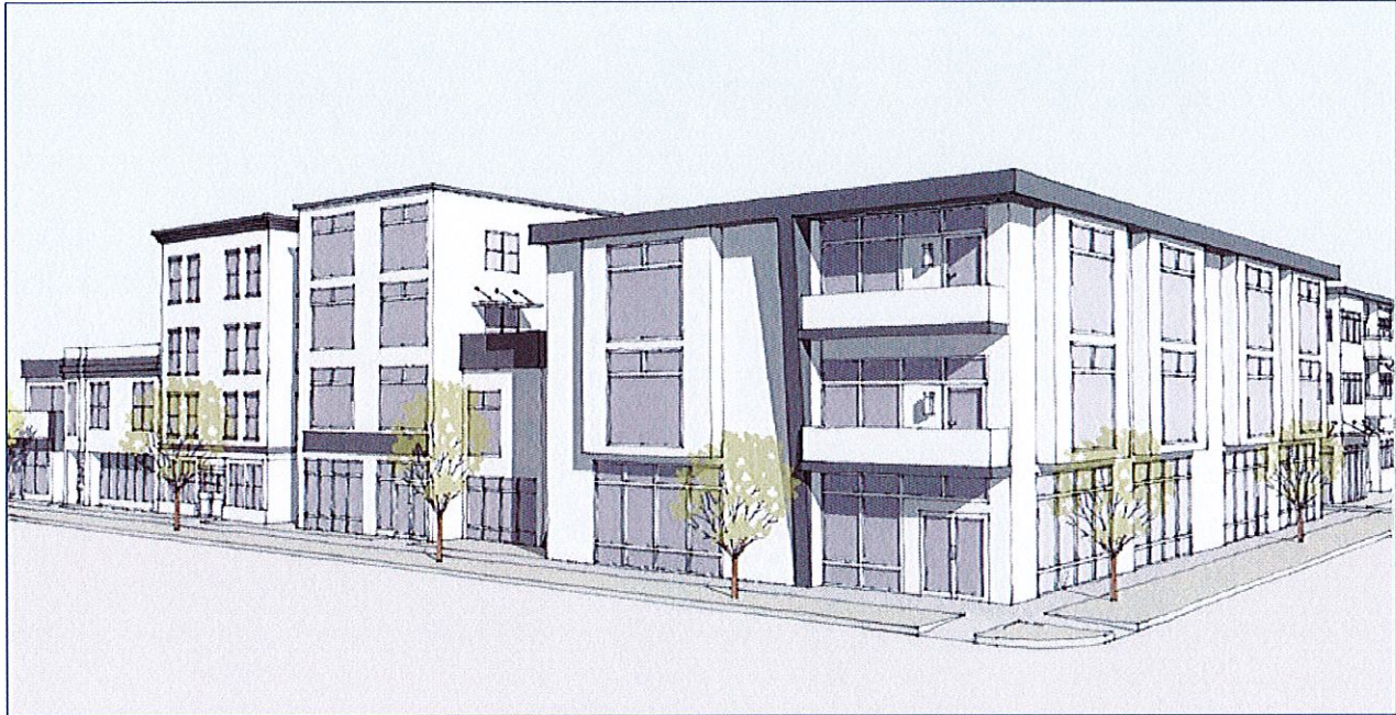
Figure 29: Illustrative Scale and Character

The Mixed-Use Downtown Core (MD-DC) character area is intended to draw upon the design traditions exhibited by historic commercial buildings by providing individual, detailed storefront modules that are visually interesting to pedestrians, and to promote infill and redevelopment of sites using residential densities and building heights that are higher in comparison to other character areas within the downtown.