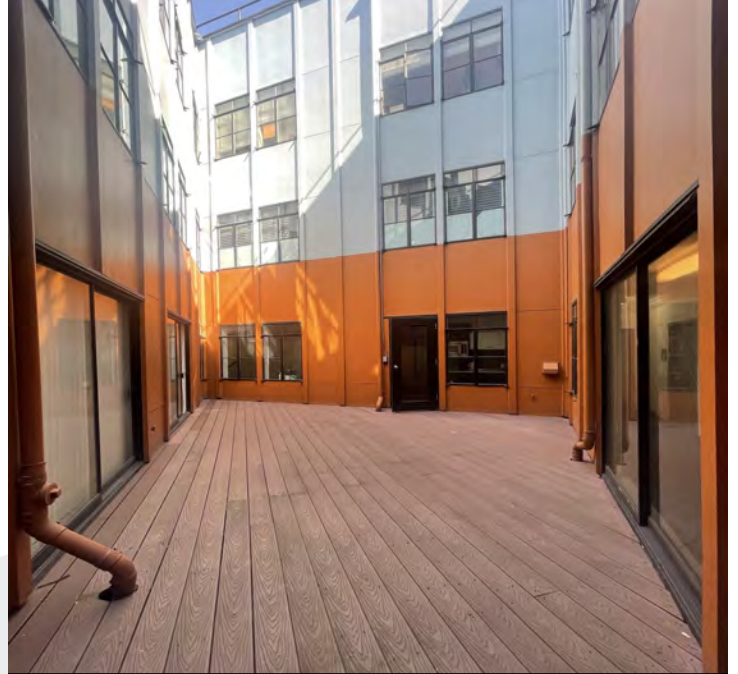
222 Columbus | 2nd Floor Common Area Atrium Patio