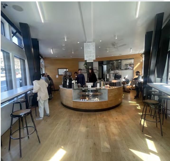
222 Columbus | Cafe Reveille