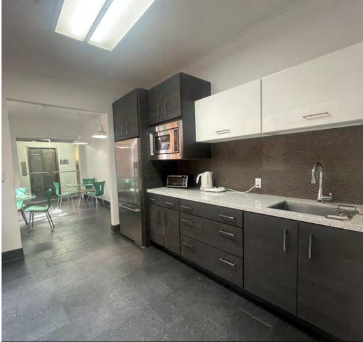
222 Columbus | Common Area Break Room Amenity