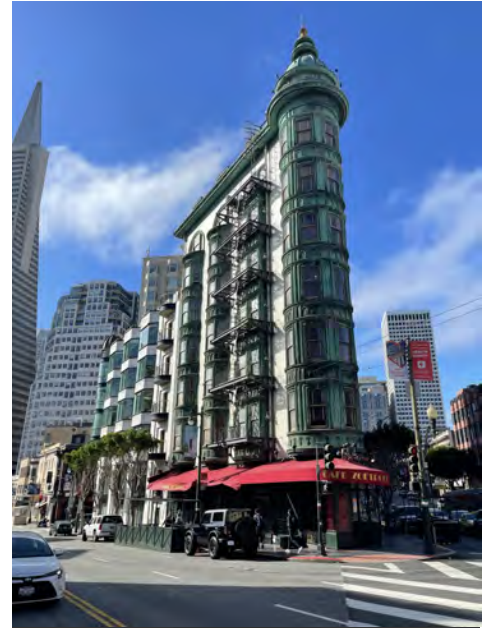
Francis Ford Coppola Building