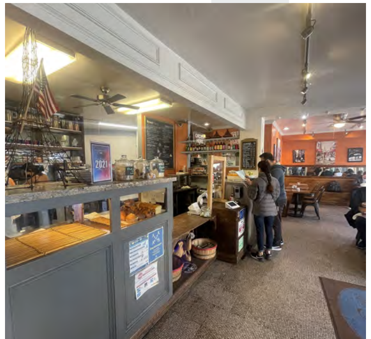
222 Columbus | Brioche Bakery & Cafe