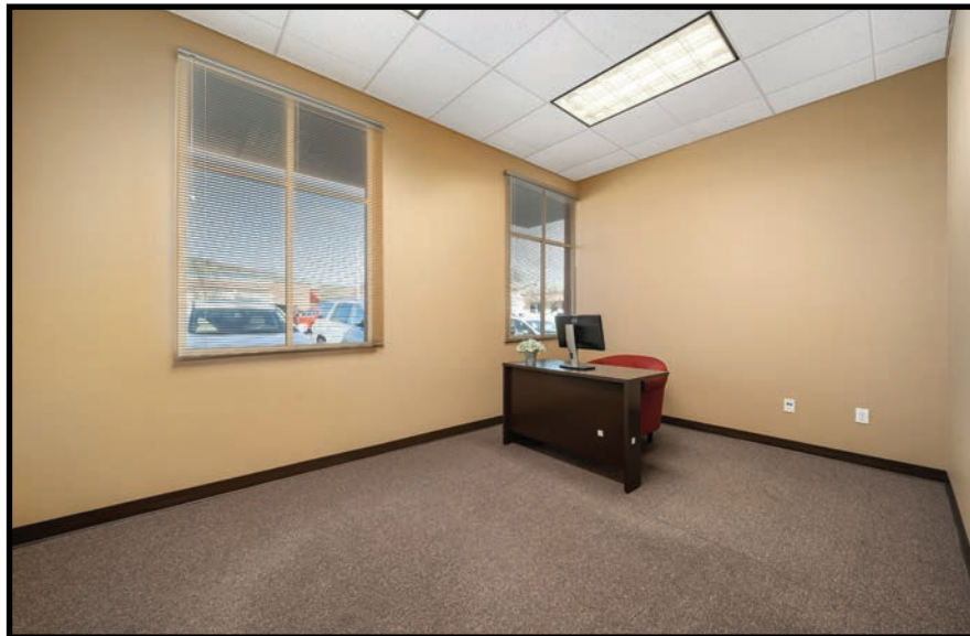
Private Office #3