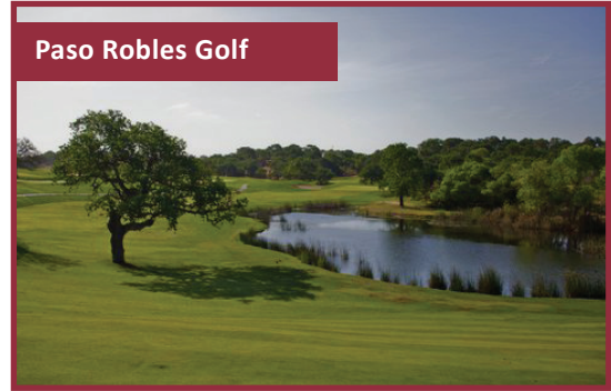
Paso Robles Golf

GOLF - The scenic town of Paso Robles is one of California's best kept secrets. With four golf courses you have a reason to stay awhile and enjoy the local wine and food scene.