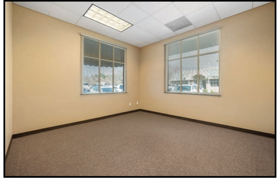
Private Office #2