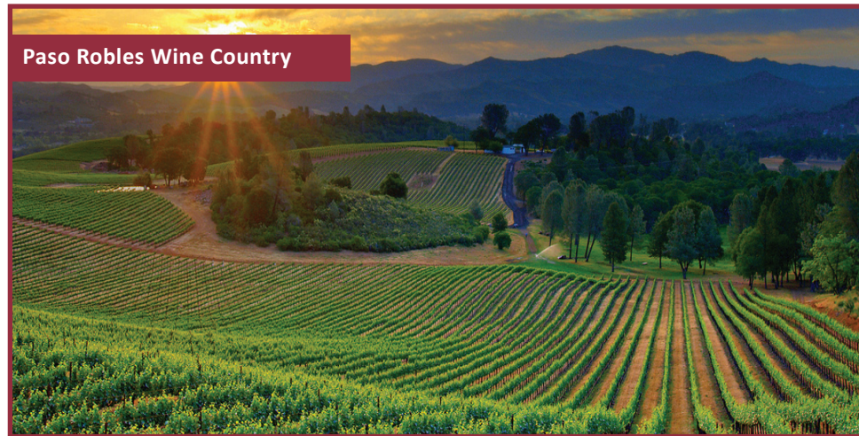
Paso Robles Wine Country

Entertainment - Nestled on a picturesque, oak-dotted hillside, featuring a variety of music and entertainment. Vina Robles Amphitheater was named one of North America's "Must Play Venues of 2016" by music industry publication Amplify.