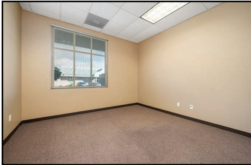
Private Office #1