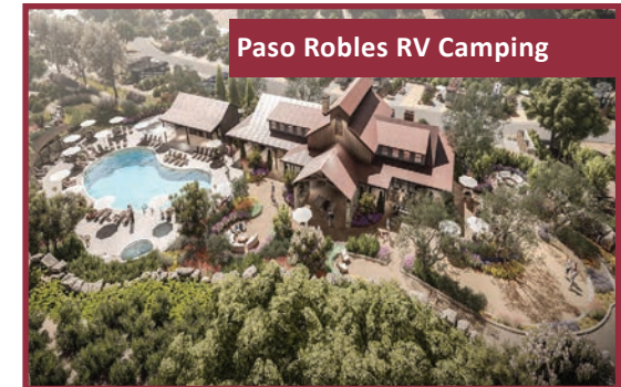
Paso Robles RV Camping

RV Camping - For those whose traveling ways mean hittin' the dusty trail RV style. Pull in and park in one of Paso's highly rated RV parks. Cava Robles, Wine Country RV Resort, Vines RV Resort, and Paso Robles RV Ranch & Campground are just a few in the area.