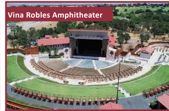
Vina Robles Amphitheater

Entertainment - Nestled on a picturesque, oak-dotted hillside, featuring a variety of music and entertainment. Vina Robles Amphitheater was named one of North America's "Must Play Venues of 2016" by music industry publication Amplify.