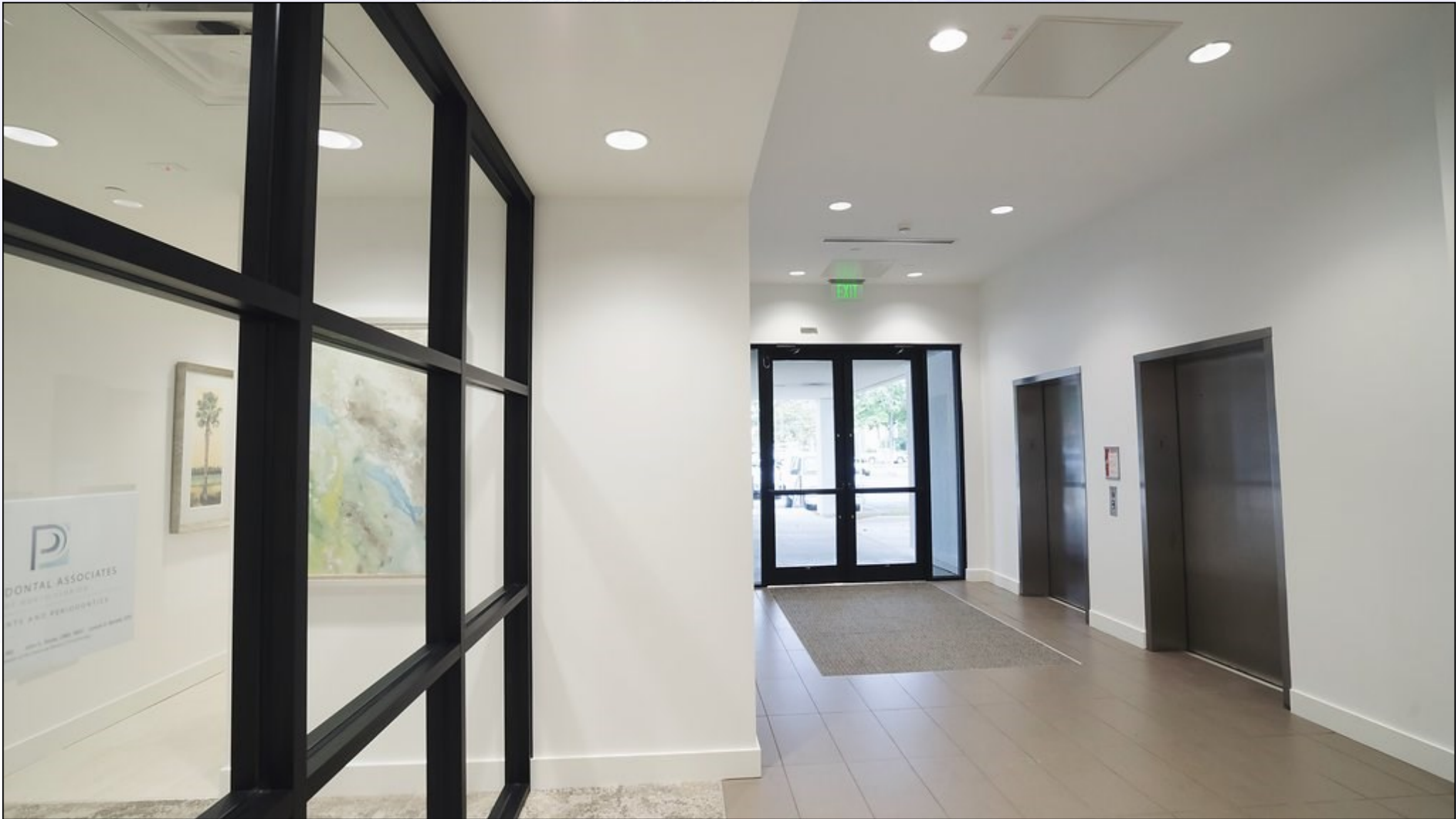
Building Lobby-First Floor Entrance