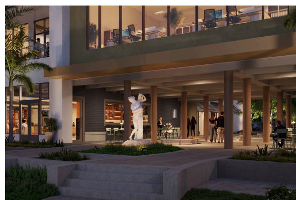
FIRST AVE S. MAIN VIA