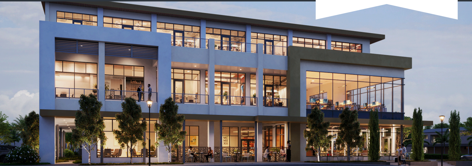
VIEW OF THE RESTAURANT FROM THE PLAYHOUSE