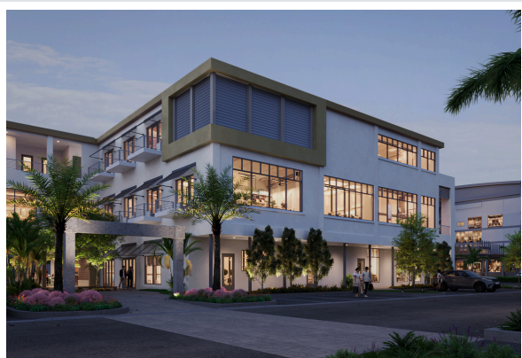
VIEW FROM CITY PARKING GARAGE