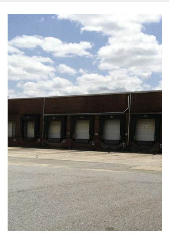
119 S Forrest St