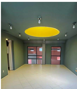
Area with overlook