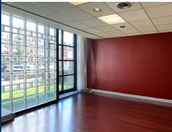
Front entrance space