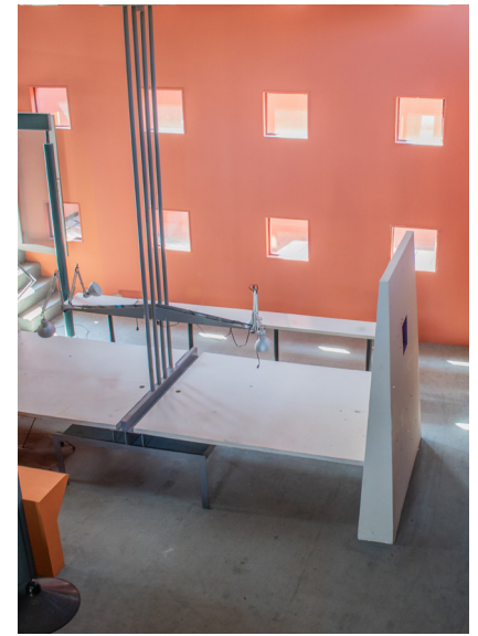
Open space with drafting table