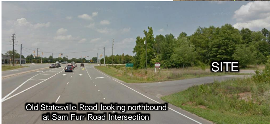
Old Statesville Road looking northbound at Sam Furr Road Intersection