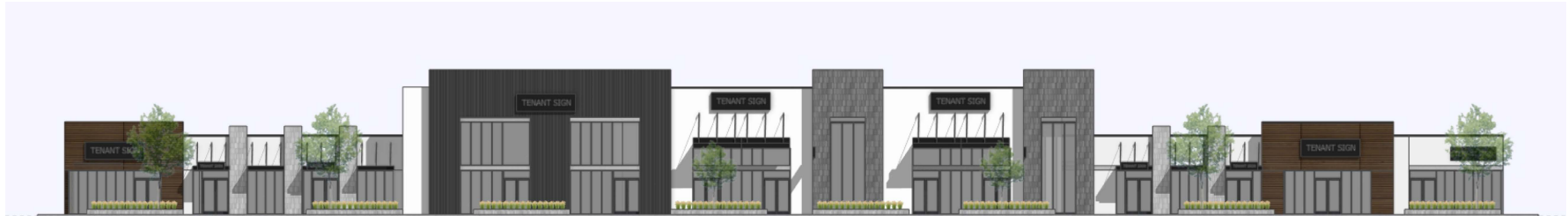
Alameda Retail Concept - Pocatello, ID methodstudio