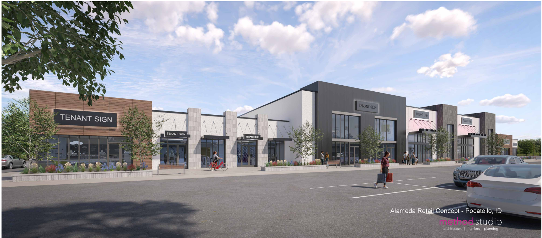
Alameda Retail Concept - Pocatello, ID methodstudio architecture | interiors | planning