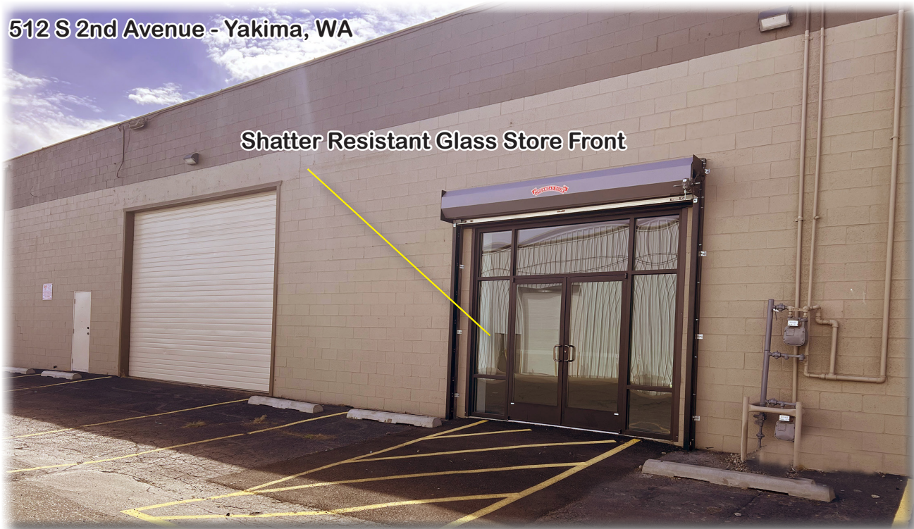
Shatter Resistant Glass Store Front