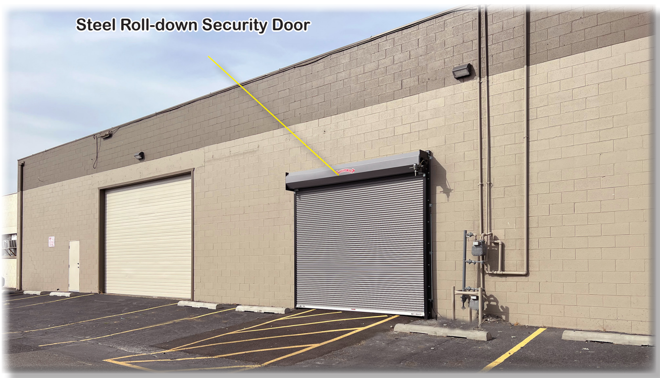
Steel Roll-down Security Door

The property has secure access through the front only through a steel door, an 8' x 8' secure glass storefront with steel roll down security door for night protection. Outside is fully illuminated with high intensity security lights. Property was completely rebuilt in 2023 - new 600 amp, 240v - 3 phase electrical service, new water and plumbing system, 2 new ADA restrooms, new HVAC systems, new gas heat in warehouse, fully insulated (R38), new sheet-rock/plywood walls, high intensity LED lighting systems. Owner willing to add tenant improvements, (i.e., additional shop rooms, lighting, electrical distribution, floor drains, showroom, and additional office space) if required by tenant and can be including in the costs of lease.