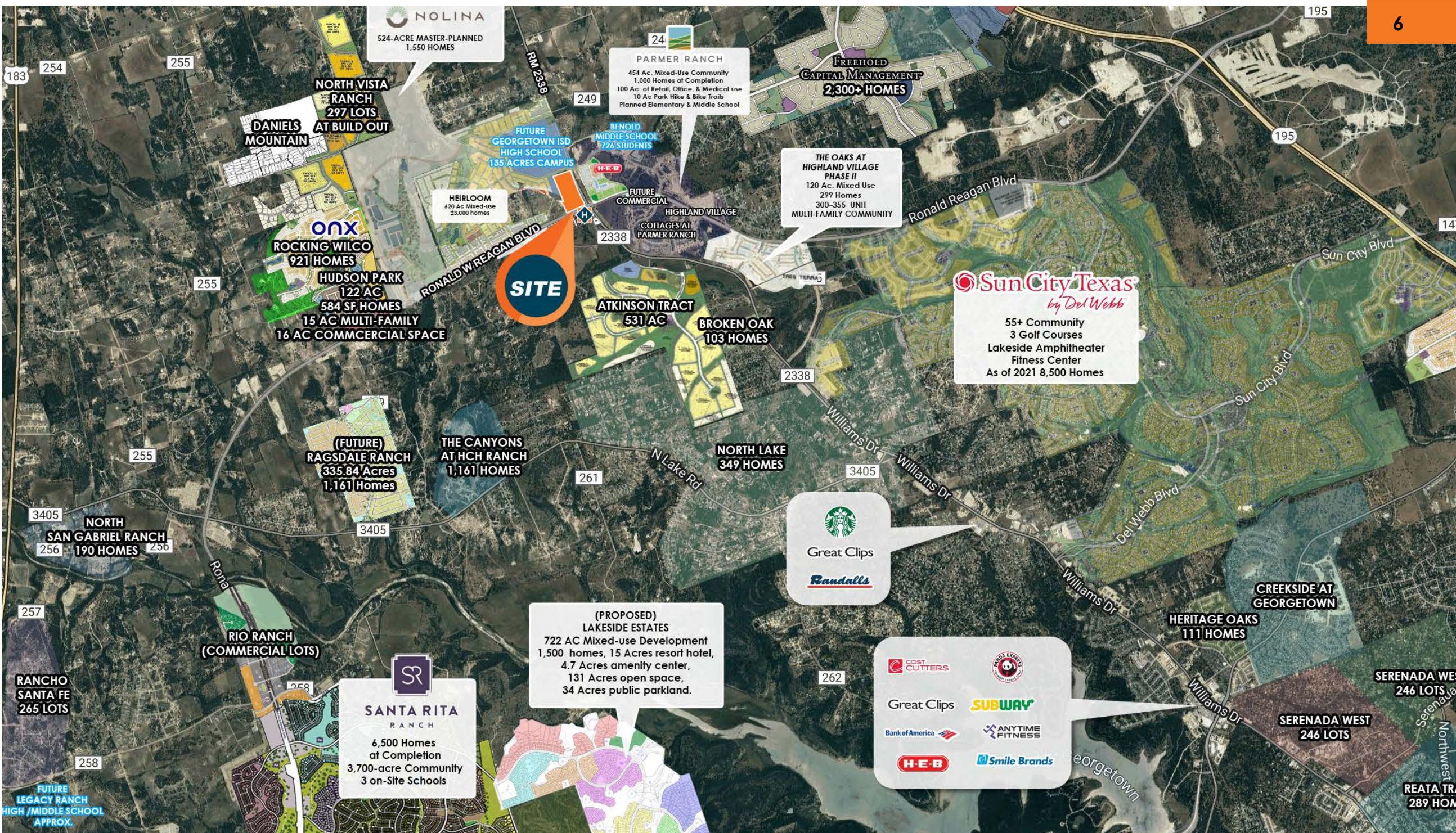
Shops at Williams Ranch | NWC of Ronald Reagan Blvd. & RM 2338 (Williams Dr.), Georgetown, Texas, 78633