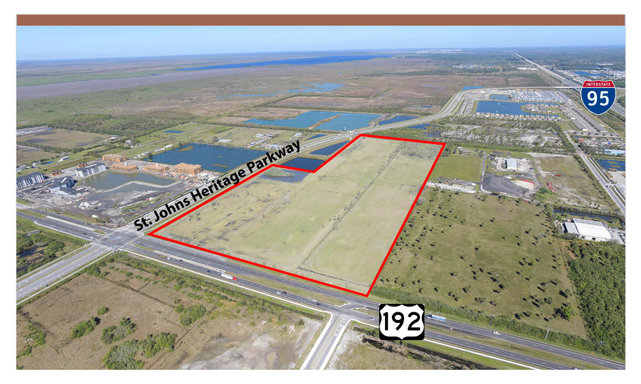
Aerial Of Location