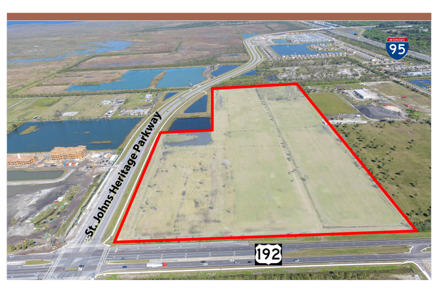
Aerial Of Location