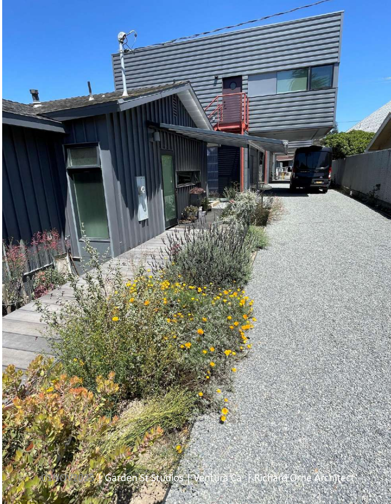
© 2025 | Garden St Studios | Ventura Ca | Richard Orne Architect