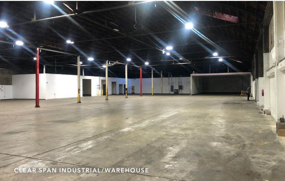
CLEAR SPAN INDUSTRIAL/WAREHOUSE