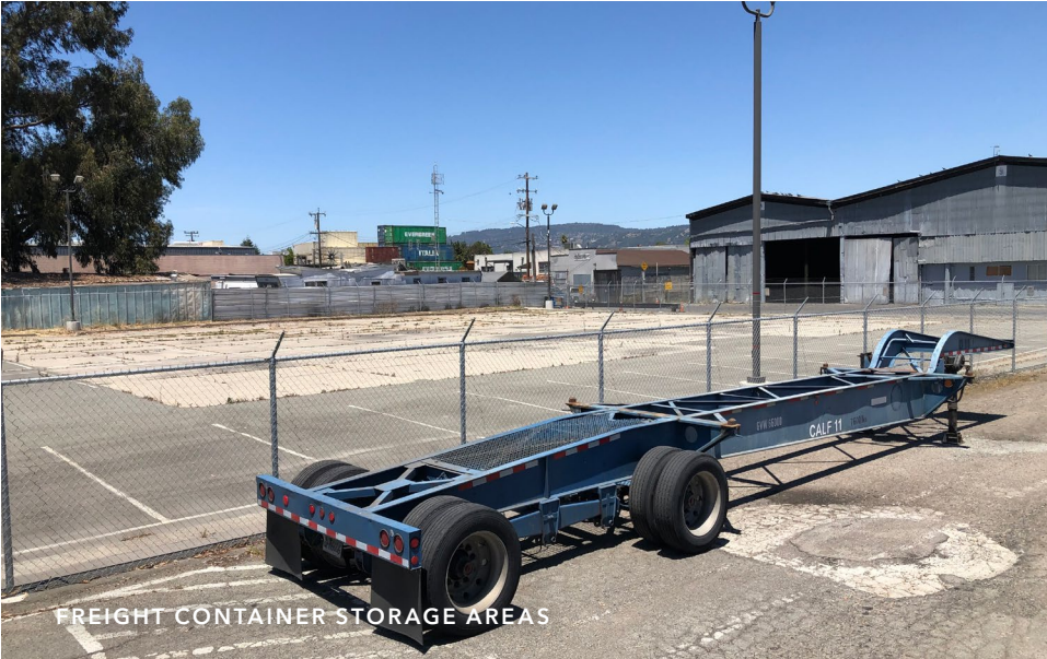
FREIGHT CONTAINER STORAGE AREAS