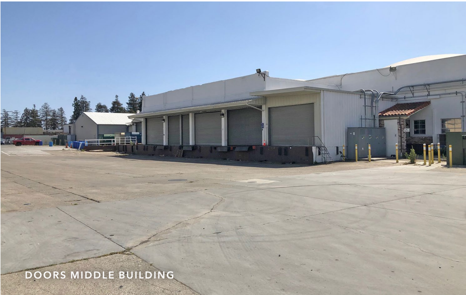
DOORS MIDDLE BUILDING