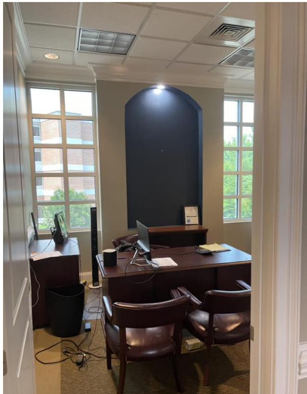
Large private office 11' 5" x 13'