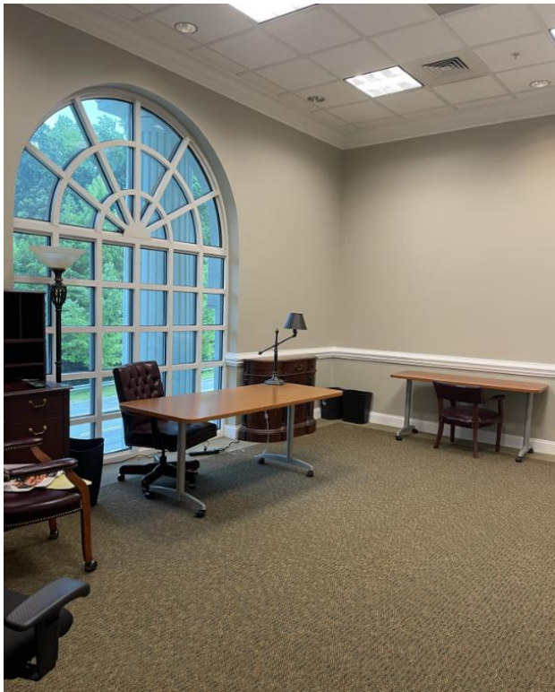
Large office - can accommodate 4-5 desks and/or conference room.