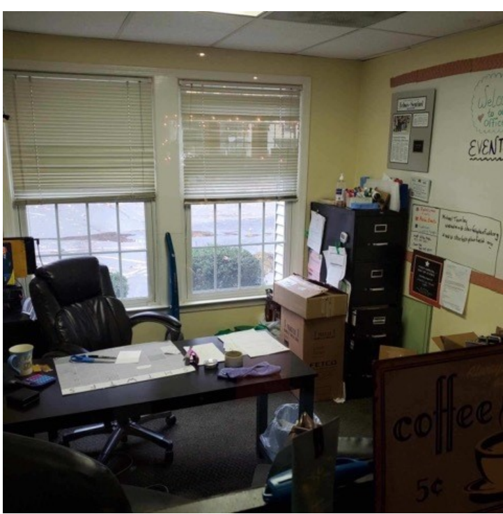
Cafe back office