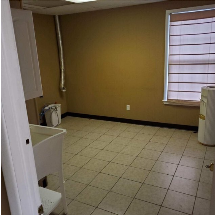
Salon back room 2