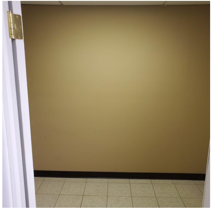
Salon back room