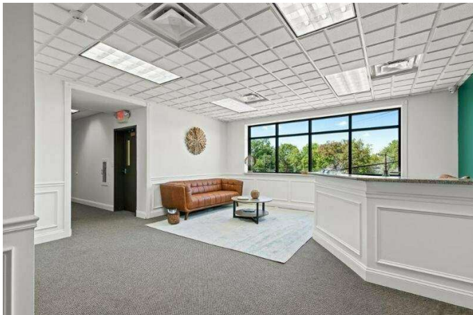
Third Floor Lobby