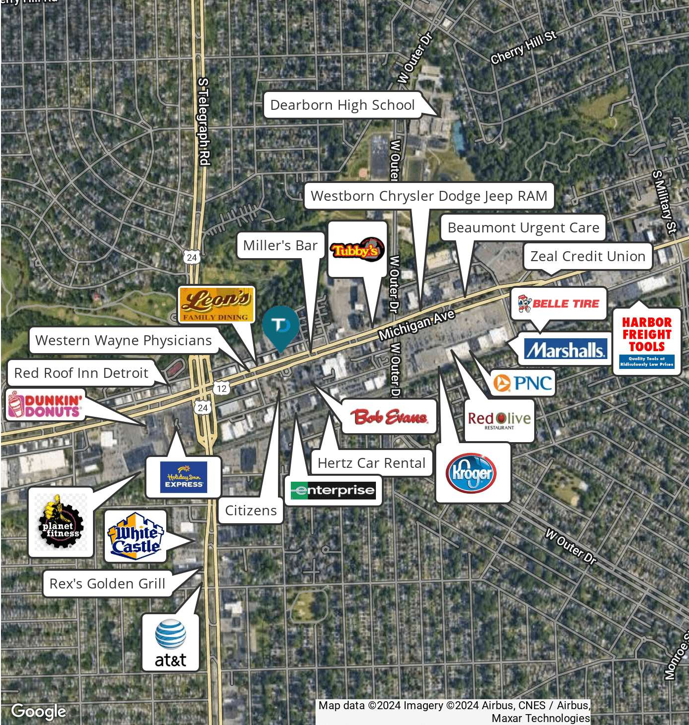
Map data ©2024 Imagery ©2024 Airbus, CNES / Airbus, Maxar Technologies