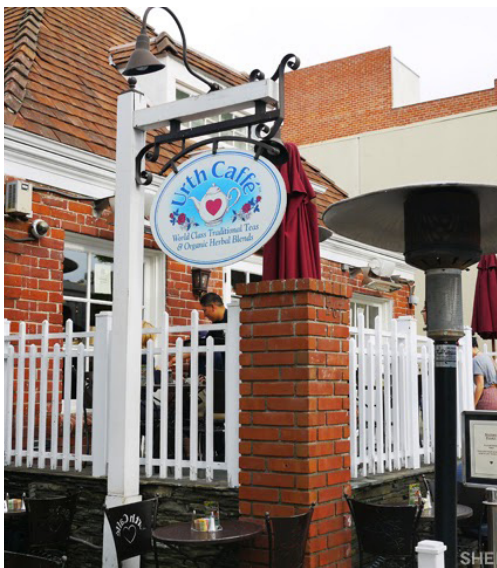
📍 URTH CAFFÈ