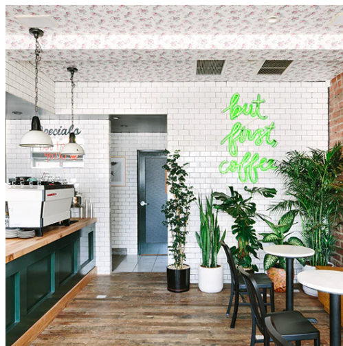
📍 ALFRED COFFEE