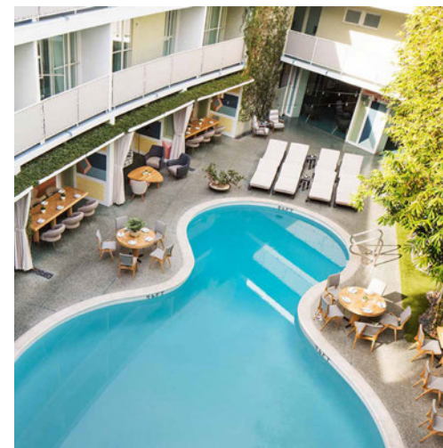
📍 AVALON HOTEL