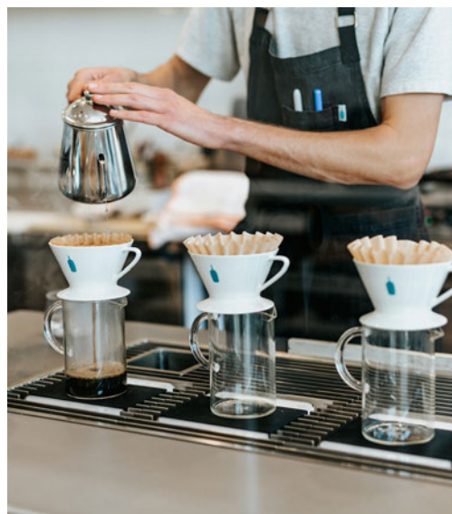
📍 BLUE BOTTLE COFFEE