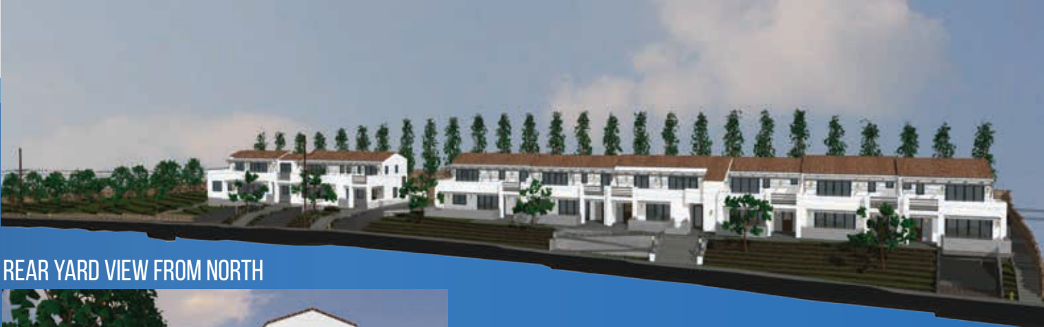
REAR YARD VIEW FROM NORTH