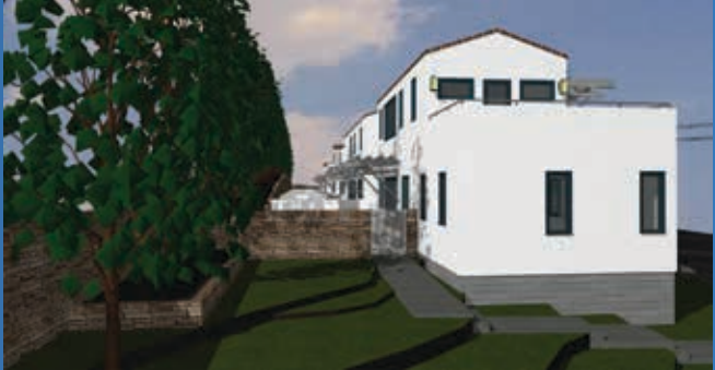
STREET VIEW FROM SOUTH