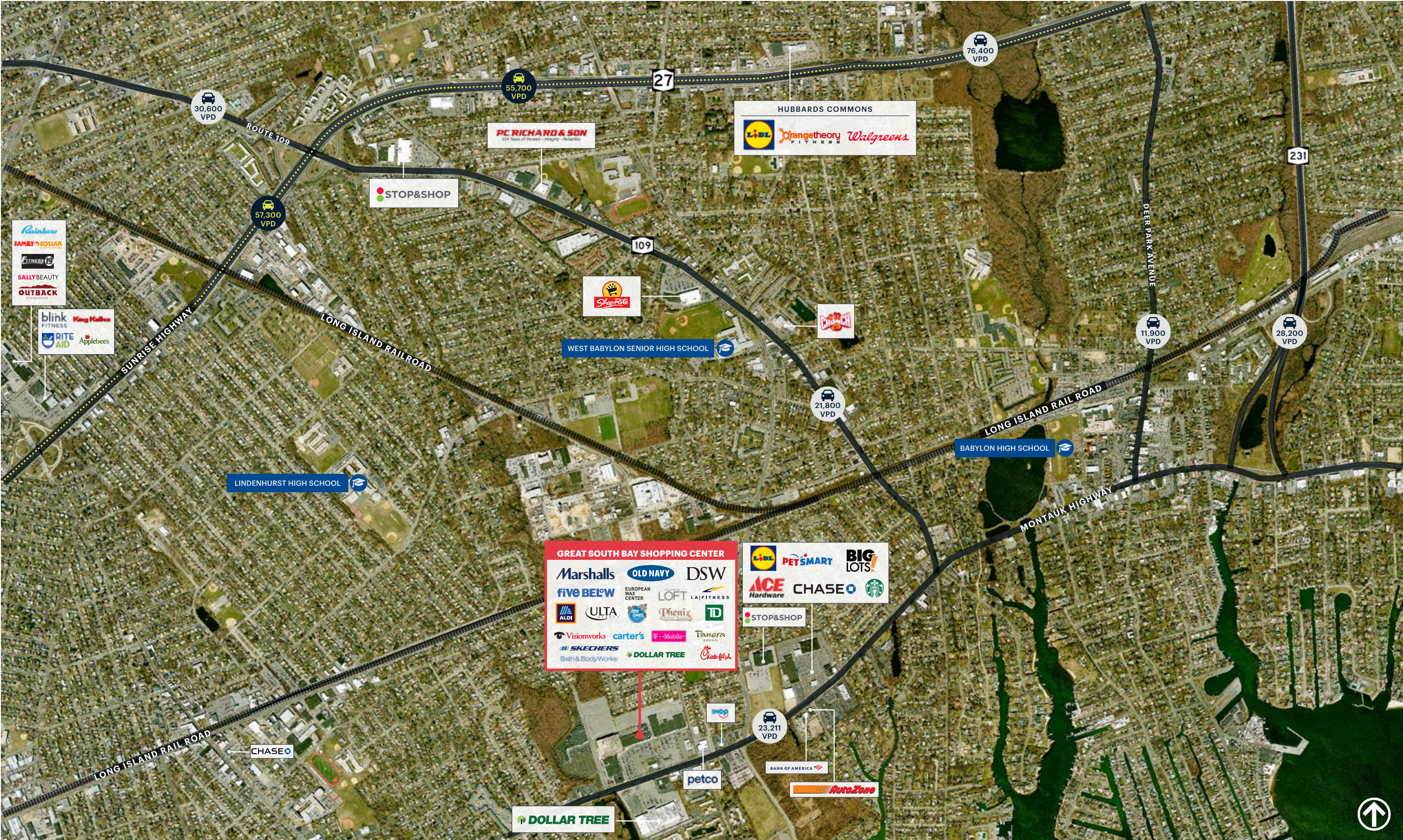
GREAT SOUTH BAY SHOPPING CENTER WEST BABYLON, NEW YORK