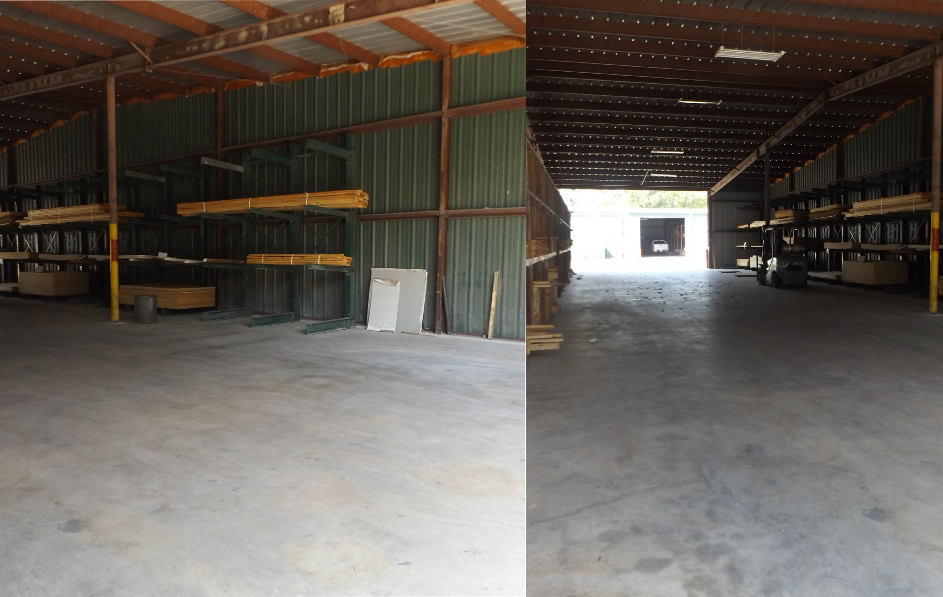
4654 Rigsby | San Antonio | TX 78222