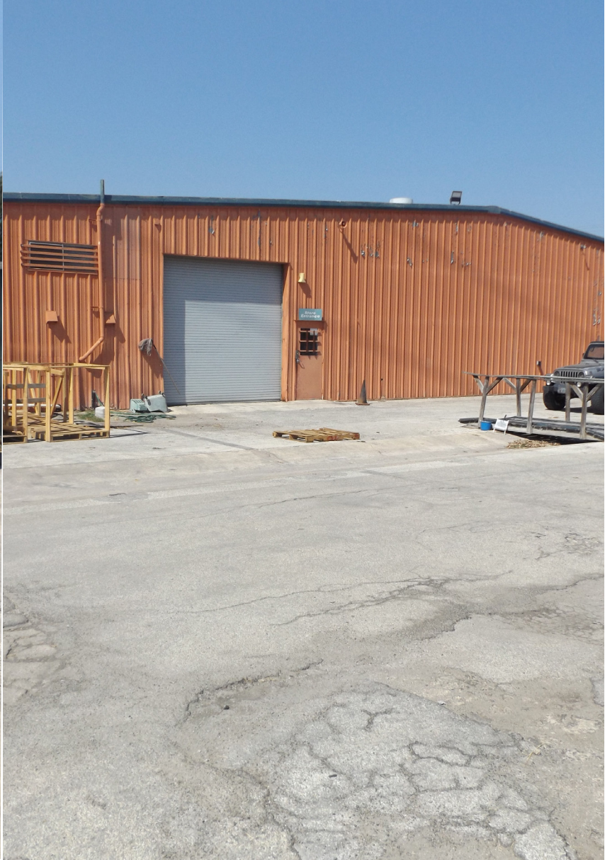
4654 Rigsby | San Antonio | TX 78222