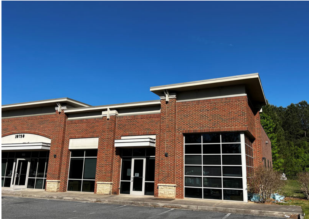
10750 Medlock Bridge Road | Duluth, GA 30097