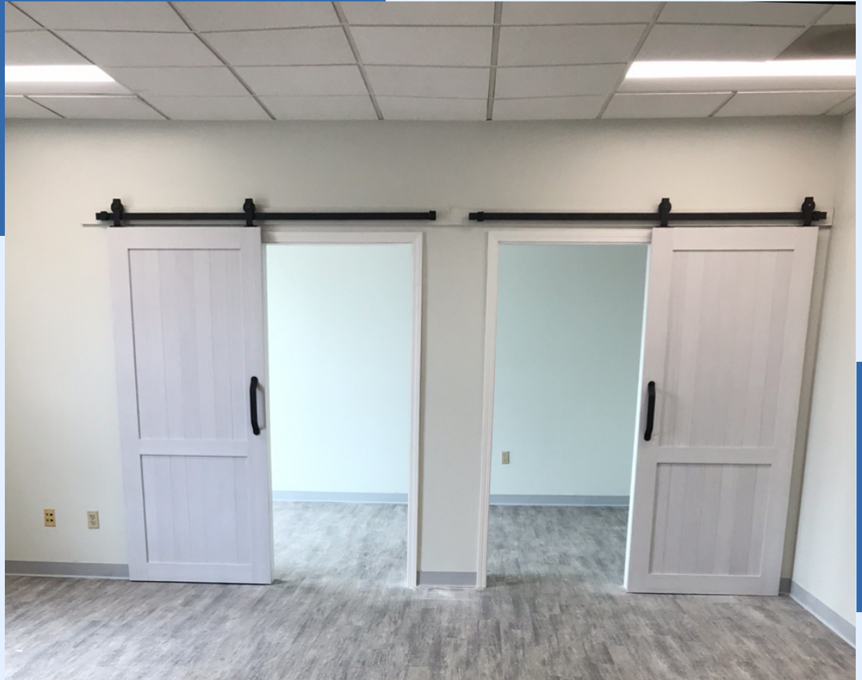
● Building 14 Suite 1404